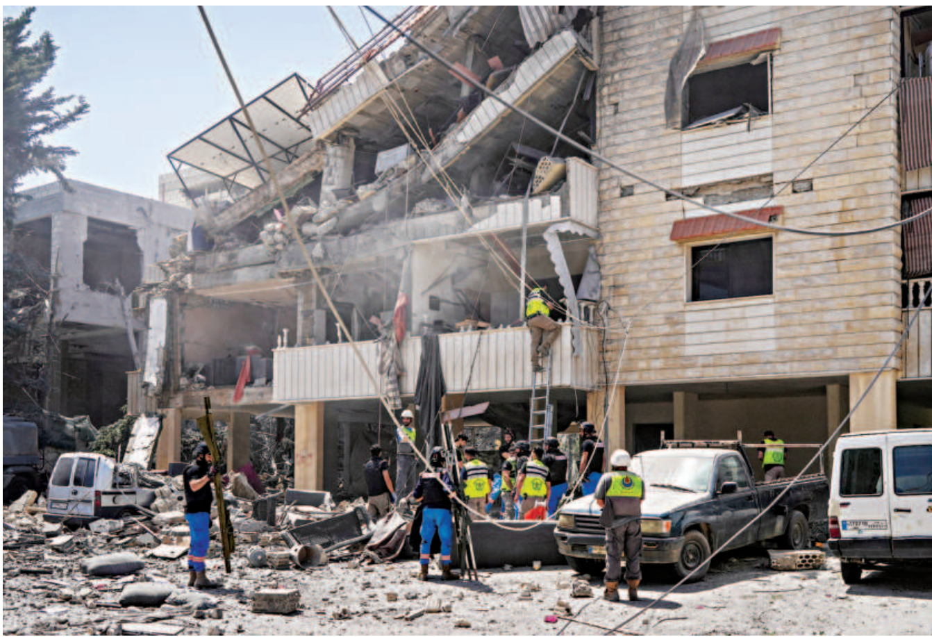
Rescuers work at the site of an Israeli strike in Kfar Jouz, Lebanon, yesterday. The Israeli military issued new threats to southern Lebanon, warning residents in nine areas to leave ahead of attacks.

US Treasury Secretary Scott Bessent will set up the visit during talks with Chinese Vice Premier He Lifeng in Seoul on Wednesday.