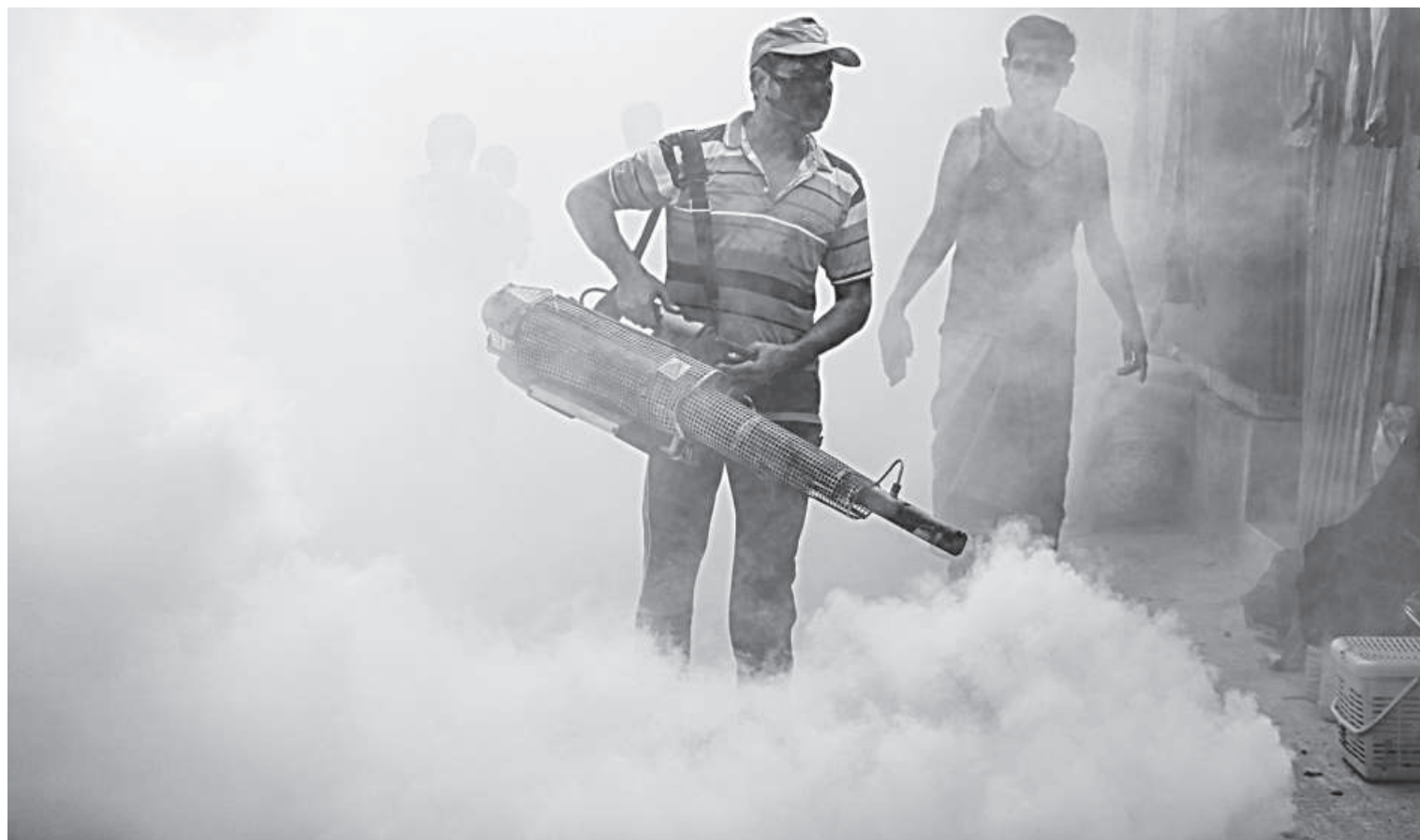
A city corporation worker conducts fogging in Khulna city to curb dengue and other mosquito-borne diseases amid rising mosquito infestation during the rainy season. The photo was taken in the Bastuhara area yesterday.