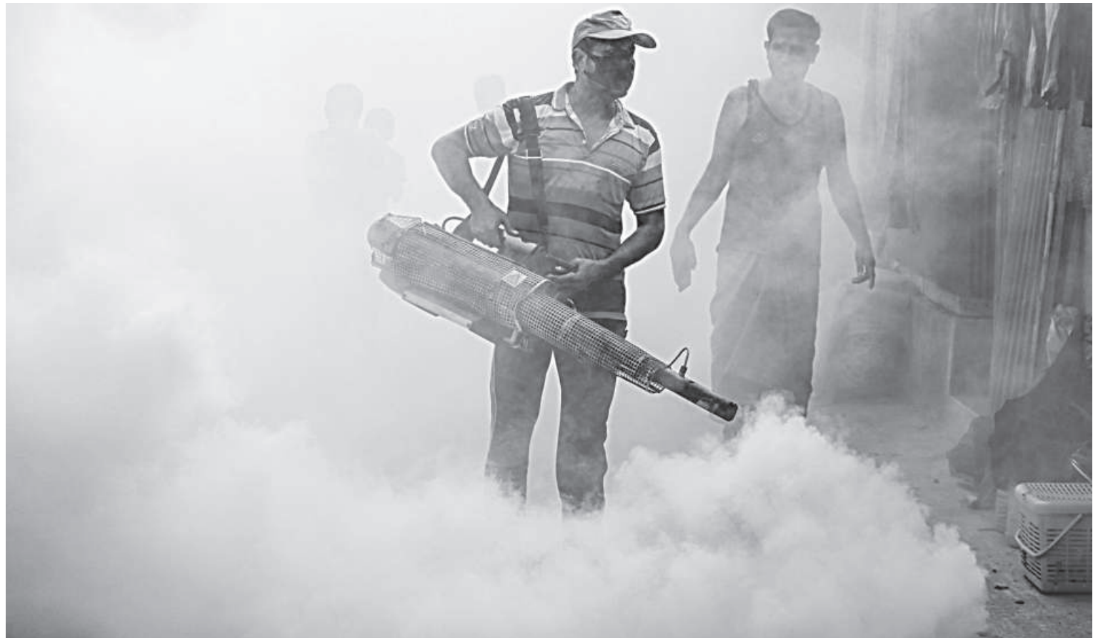
A city corporation worker conducts fogging in Khulna city to curb dengue and other mosquito-borne diseases amid rising mosquito infestation during the rainy season. The photo was taken in the Bastuhara area yesterday.