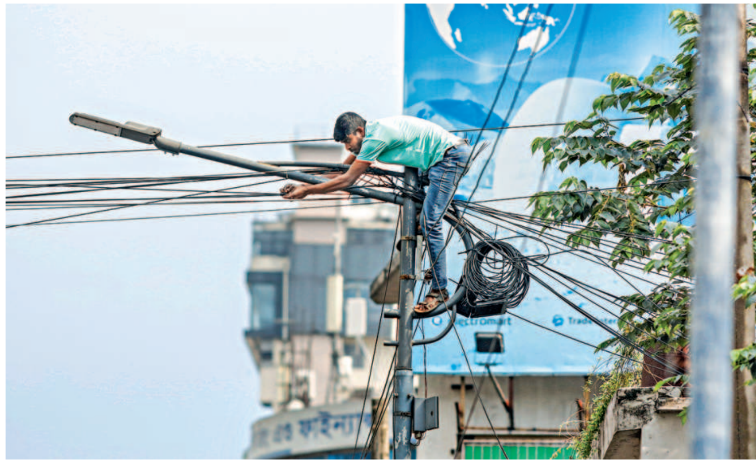
A worker perches precariously atop a light pole while carrying out maintenance work on internet cables in Dhaka's Banglamotor area yesterday. He appears to be working without any visible safety harness or protective gear amid a tangled web of overhead utility lines, risking serious injury.