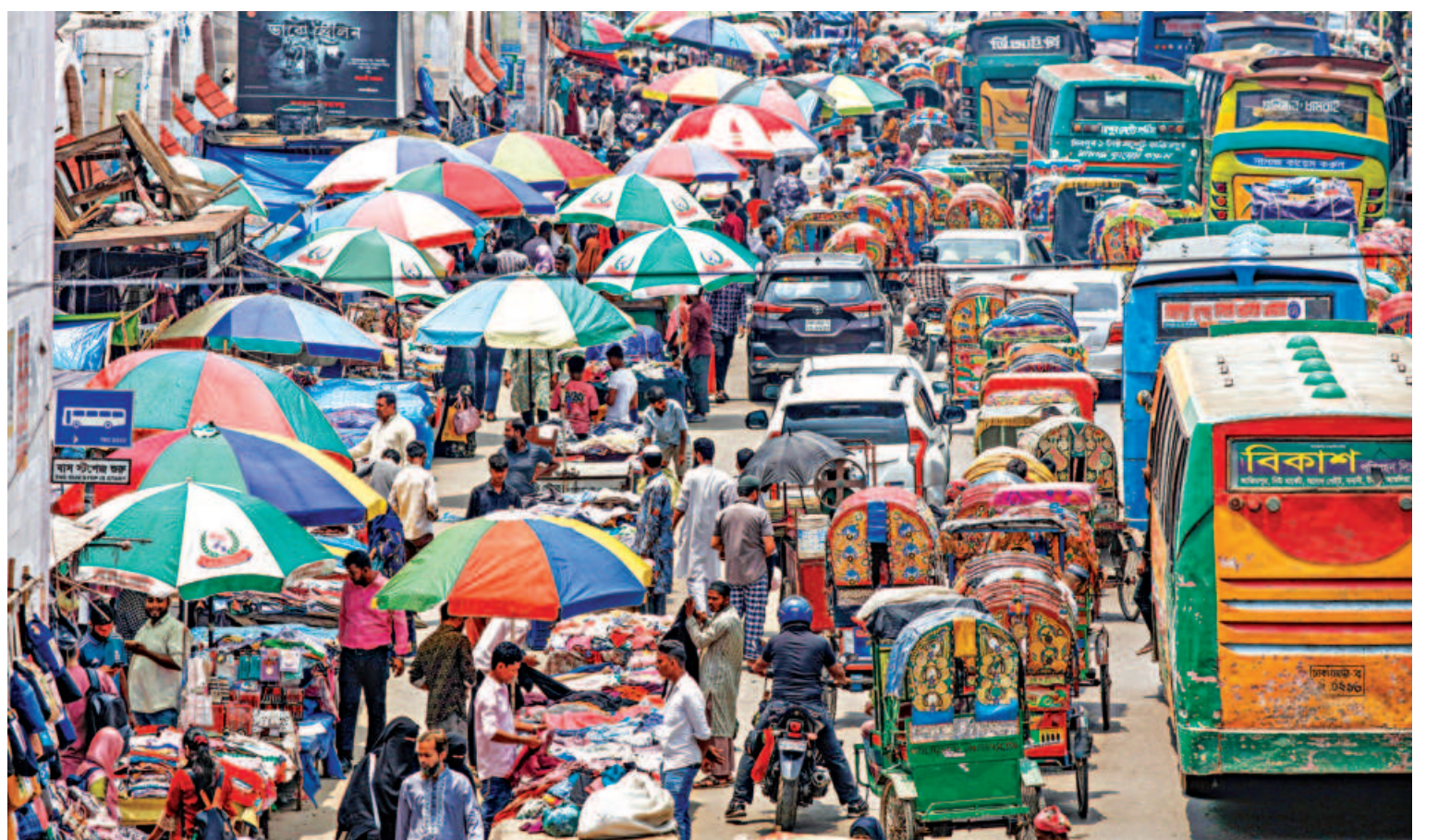
Vendors and rickshaws occupy footpaths and a significant portion of Mirpur Road in Dhaka's New Market area, just days after a police eviction drive. Despite repeated attempts by the authorities to clear the footpaths and road for pedestrians and vehicles, traders continue to return, causing obstructions. The photo was taken yesterday.