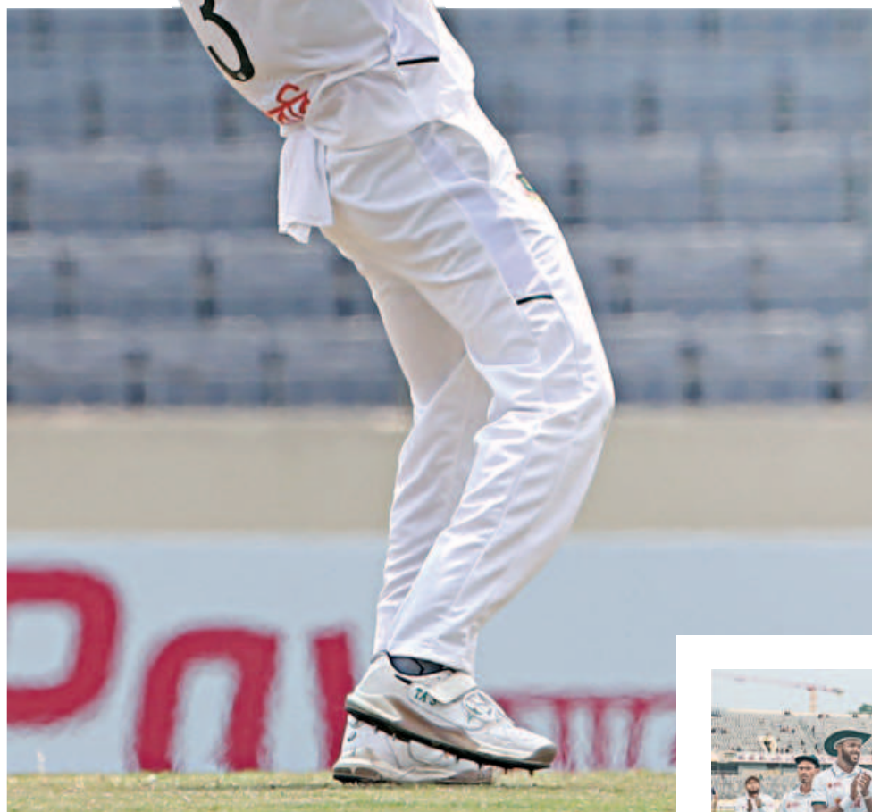
Bangladesh pacer Taskin Ahmed set the tone for the day with a fiery spell in the morning session, removing centurion Azan Awaiz and Shan Masood and cornering Pakistan in their first innings of the first Test at the Sher-e-Bangla National Cricket Stadium in Mirpur yesterday. (Inset) However, it was Mehidy Hasan Miraz's 14th five-wicket haul which helped bundle out the visitors and eventually helped the hosts to a 34-run lead at the end of the third day's play.