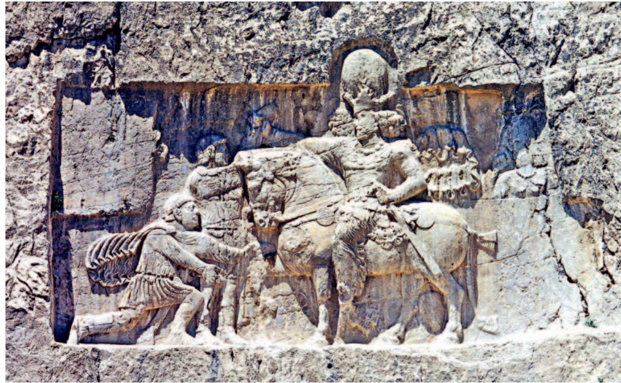
Naqsh-e Rostam. Rock relief depicting the triumph of Sasanian emperor Shapur I over the Roman emperors Philip the Arab (244–249), shown kneeling in submission, and Valerian (253–260), standing captive. Valerian's hands are concealed within his sleeves as a symbol of servitude. Circa 260 CE.

At the same time, the global rivalry between the United States, China, and Russia is increasingly shaping the region. Iran's relationships with China and Russia have grown stronger because of shared geopolitical interests and opposition to American dominance.