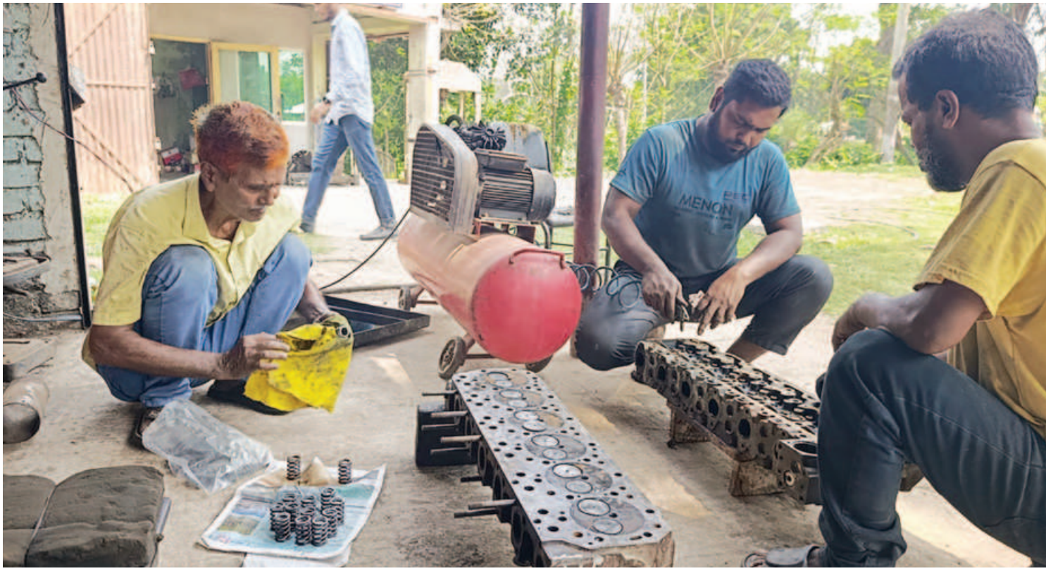
The light engineering sector lacks formal recognition and technical support, entrepreneurs in Pabna say. This photo of workers was taken from a workshop in Pabna's Gachhpara area.