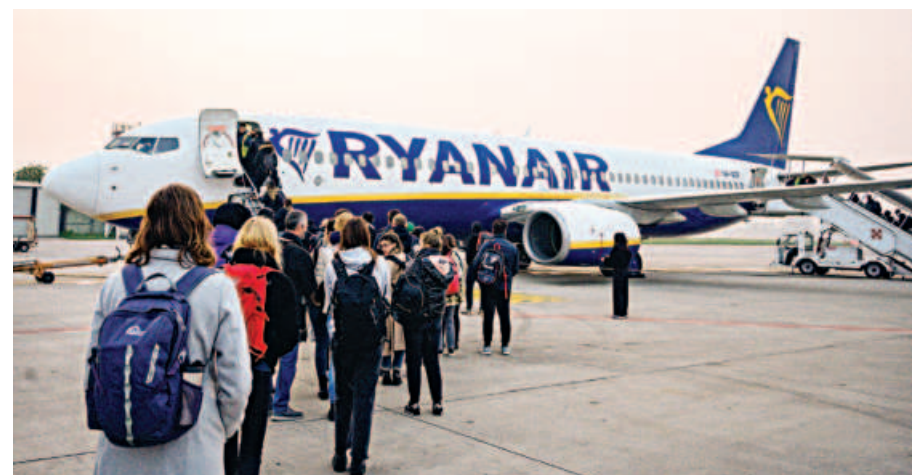
Passengers wait to board an aircraft of low cost Irish airline Ryanair at Antonio Canova airport, Italy. The US-Israeli war with Iran have sent aviation fuel prices soaring, raising the spectre of shortages during Europe's peak travel season.