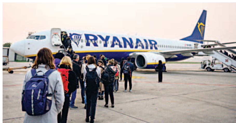
Passengers wait to board an aircraft of low cost Irish airline Ryanair at Antonio Canova airport, Italy. The US-Israeli war with Iran have sent aviation fuel prices soaring, raising the spectre of shortages during Europe's peak travel season.