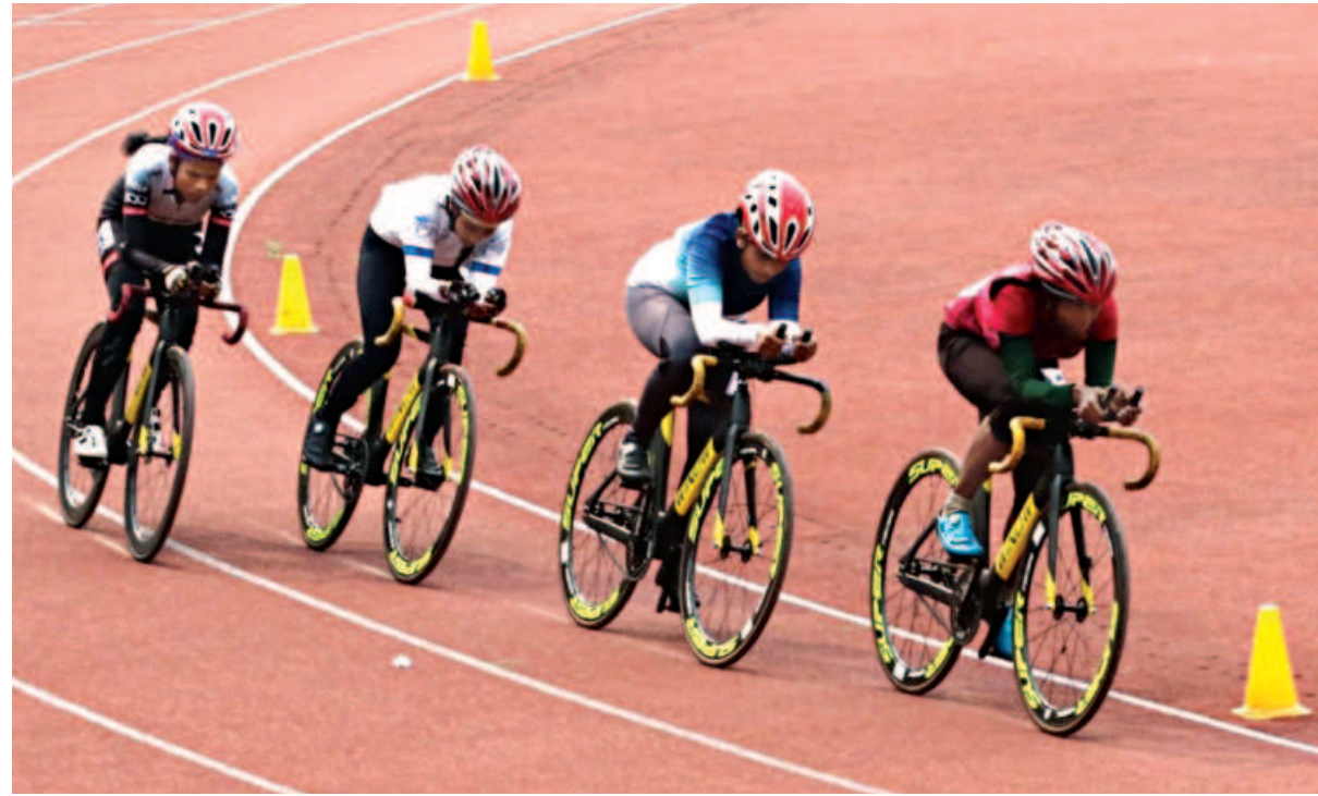
Cyclists ride through the athletics track of the National Stadium in Dhaka yesterday during women's 2000m team pursuit event on the final day of the 45th National Cycling Competition. Army dominated the competition and finished champions with 12 gold medals, followed by BGB with six, Bangladesh Ansar with one and Gazipur District Sports Association with one gold medal. A total of 225 cyclists from 18 districts and four services teams participated in the three-day competition.

That discipline, more than raw pace, ultimately marked the difference between the two attacks over the course of the day.