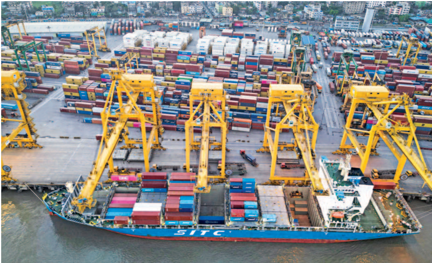
Ports will play a crucial role in shaping Bangladesh's future export competitiveness, experts said, calling for paperless and automated port systems.

Therefore, reopening the closed mills is highly important for the country's economic growth and poverty reduction.