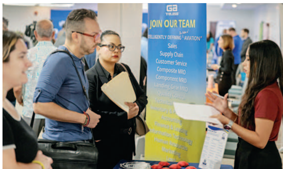
People are seen talking with a recruiter during a job fair at Miami International Airport on May 7.

The White House welcomed the new data, with spokesperson Kush Desai calling it "yet another sign that the American economy remains on a solid trajectory under President (Donald) Trump."