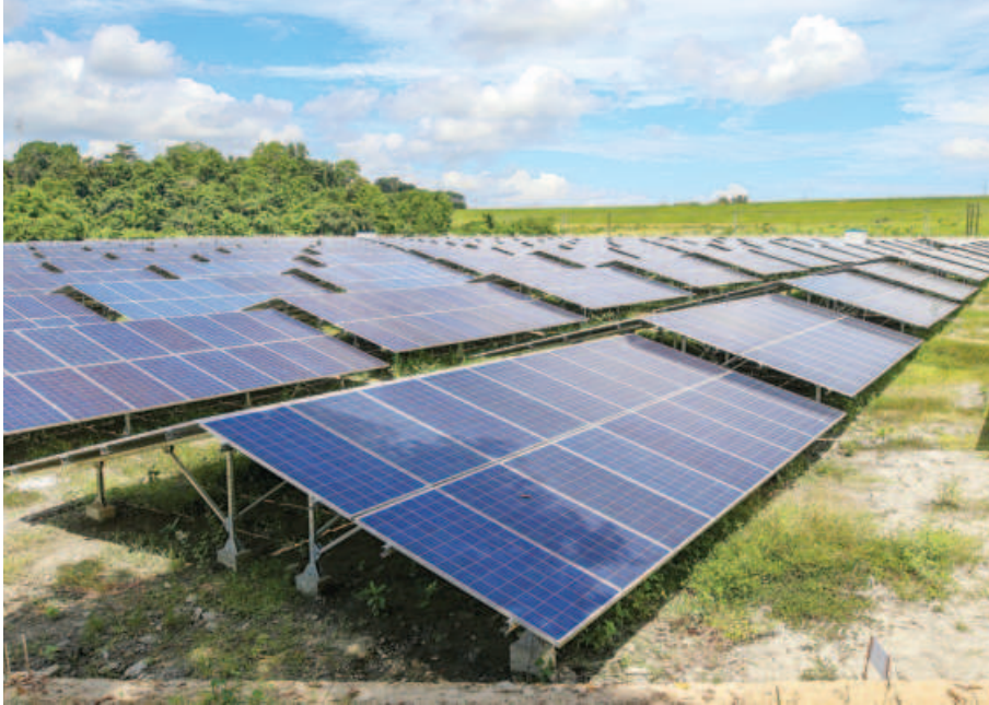
The government should offer five-year tax exemptions on solar equipment and batteries, and ensure access to green finance, said an expert.

Noting that Bangladesh's import-dependent energy structure poses a risk to national sovereignty, he called for a diversified solution comprising renewables, coal, regional cooperation,