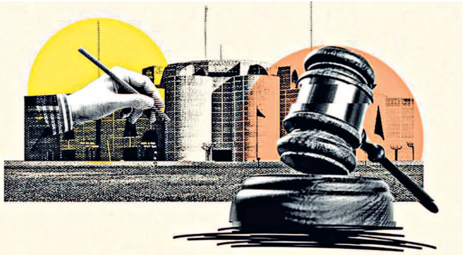
VISUAL: ANWAR SOHEL

Two constitution reform commission members on their differences