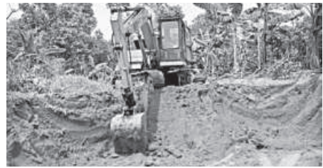
With no visible intervention from the authorities, locally influential syndicates have long been continuing such operations across the upazila, causing degradation to the ecologically sensitive areas.

With no visible intervention from the authorities, locally influential syndicates