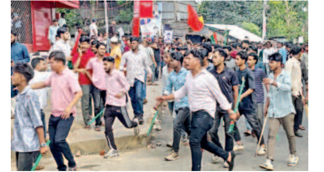
Chhatra Dal activists clash in Rangamati.

On Saturday night, 45 committees -- for university, medical college, district and metropolitan units -- were announced, including 22 new partial committees and 23 full committees.