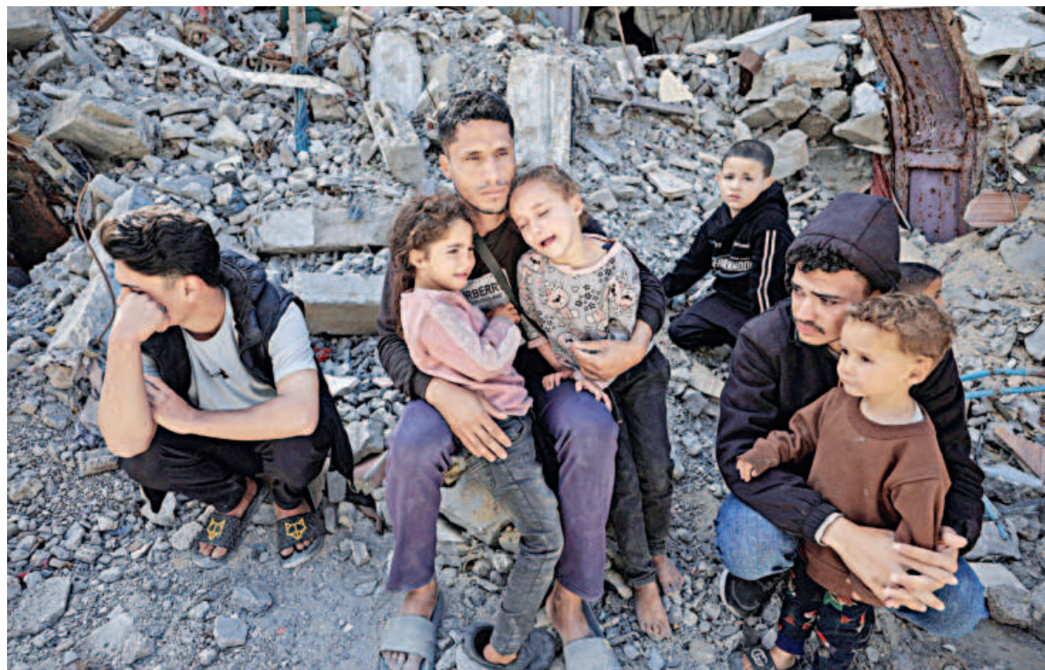
Mourners react during the funeral of a Palestinian man, who was killed by Israeli gunfire on Sunday, in Gaza City, yesterday. More than 800 Palestinians have been killed since a ceasefire took effect in October, 2025.