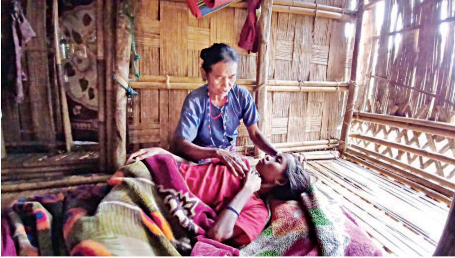
A child being treated with local remedies made from extracts of wild vines in Sinduk Mukh Para of Bandarban's Alikadam upazila. Due to poor access to healthcare, many families have turned to such practices to treat children with measles-like symptoms.