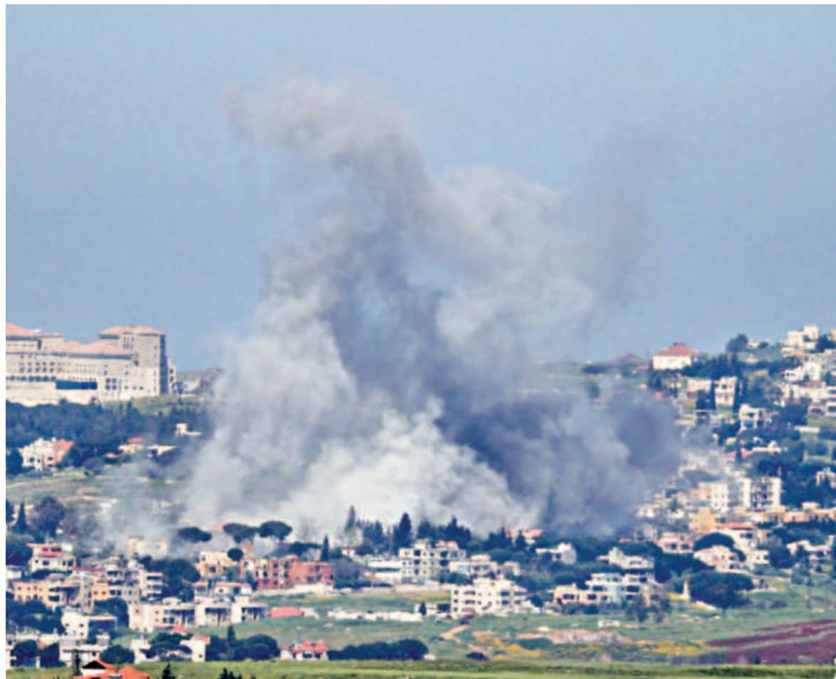
Smoke rises from the site of an Israeli airstrike that targeted the southern Lebanese village of Mayfadoun in the Nabatieh district yesterday.