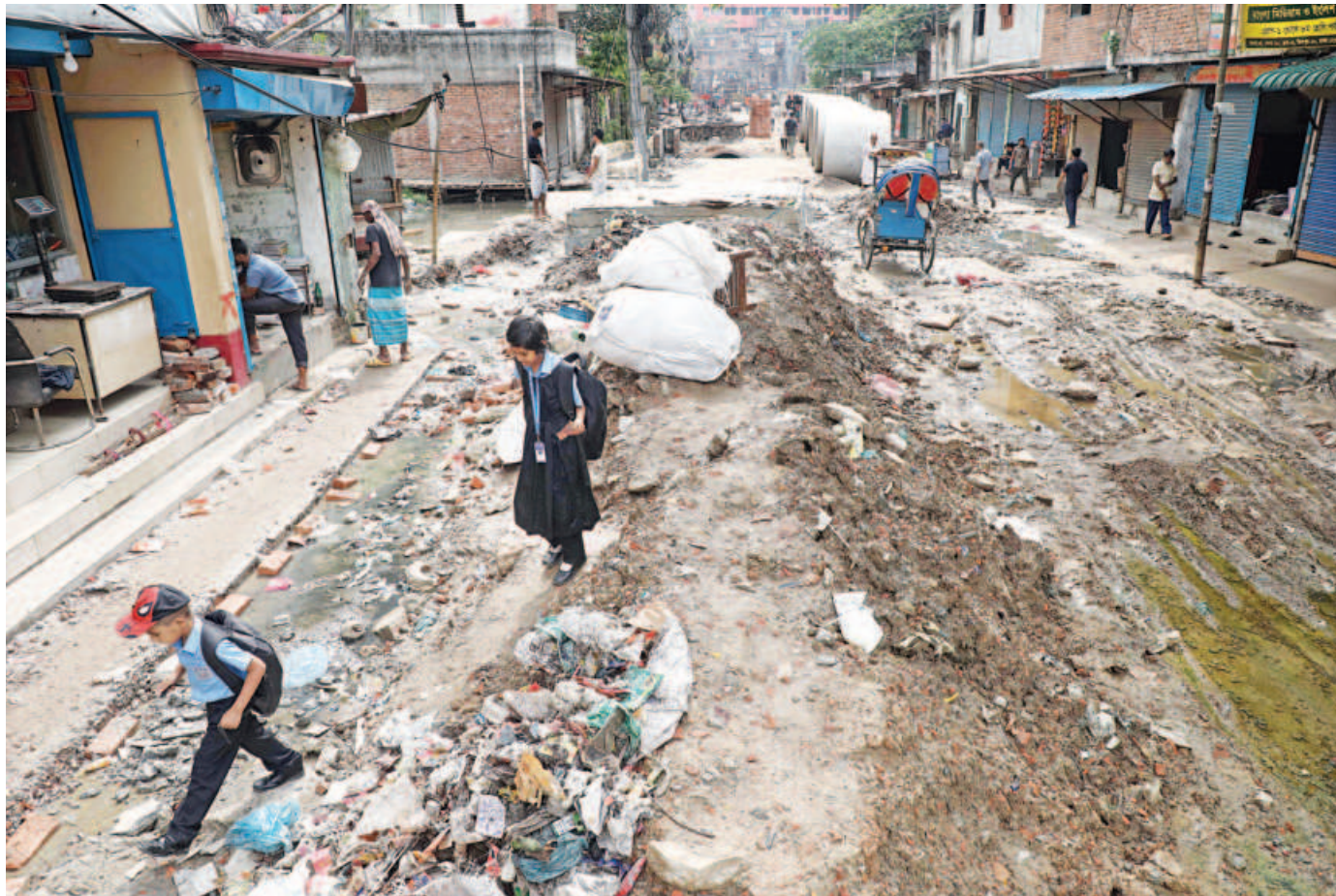
The sluggish pace of development work by Dhaka North City Corporation, including sewerage upgrades on Paris Road in the capital's Mirpur-11, continues to drag on, causing prolonged suffering to everyday commuters, especially schoolchildren and office-goers. The photo was taken recently.