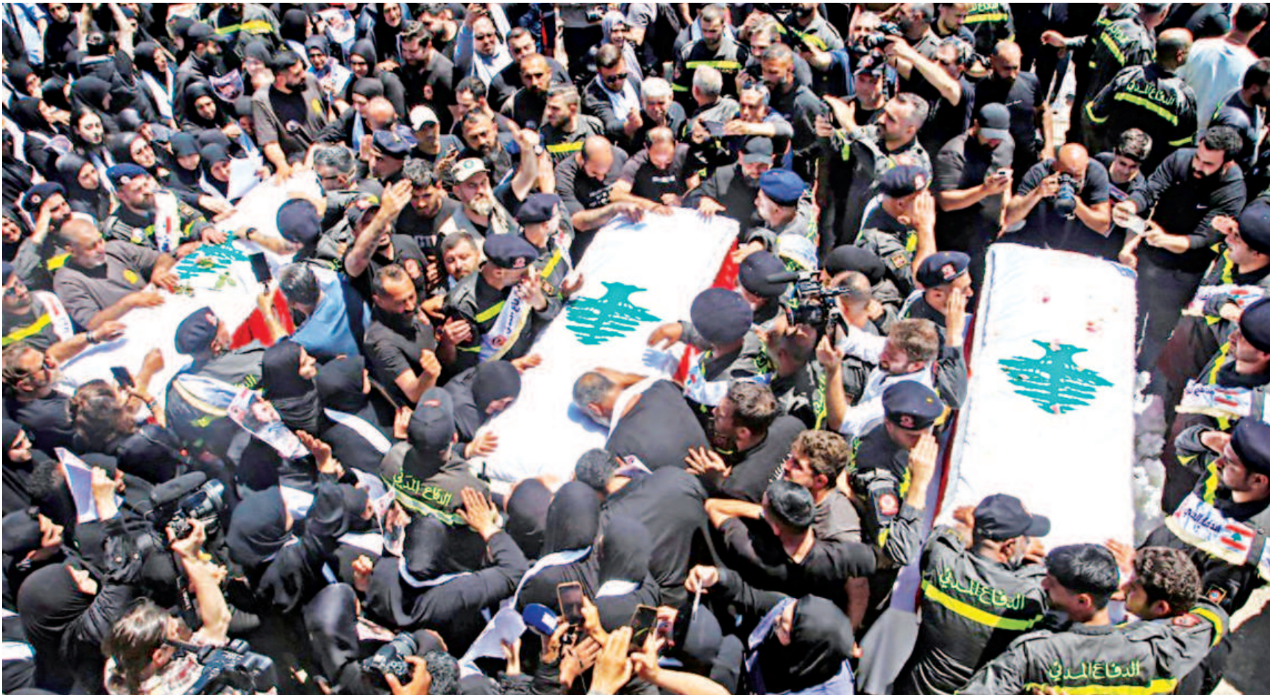
Mourners gather around the coffins of three Lebanese Civil Defense members who were killed in an Israeli airstrike on the town of Majdal Zoun, during their funeral in the southern city of Tyre yesterday.