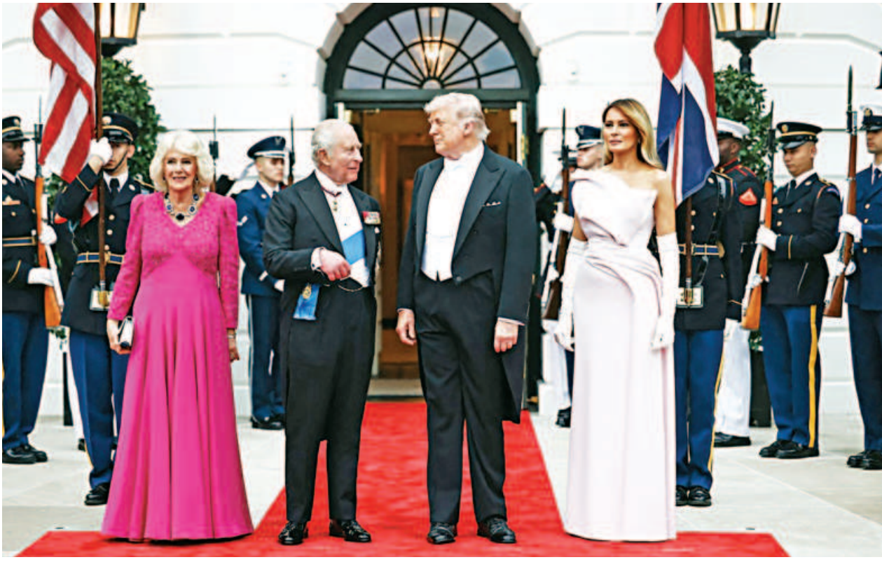
US President Donald Trump and First Lady Melania Trump pose with Britain's King Charles III and Queen Camilla as they arrive ahead of a State Dinner in the East Room of the White House in Washington, DC, on Tuesday (US time). The trip, which comes as the US approaches the 250th anniversary of its independence from Britain, is meant to celebrate the strong relationship between the two countries.