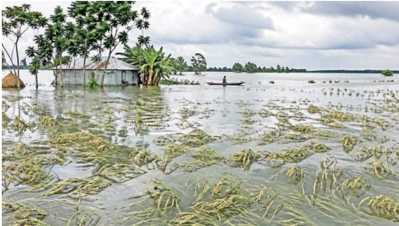
Ripe and semi-ripe paddy in Medar Beel, a major haor wetland in Netrokona, lie completely submerged yesterday after four days of continuous rains and runoff from Meghalaya hills triggered widespread waterlogging across the district, leaving farmers in deep uncertainty.