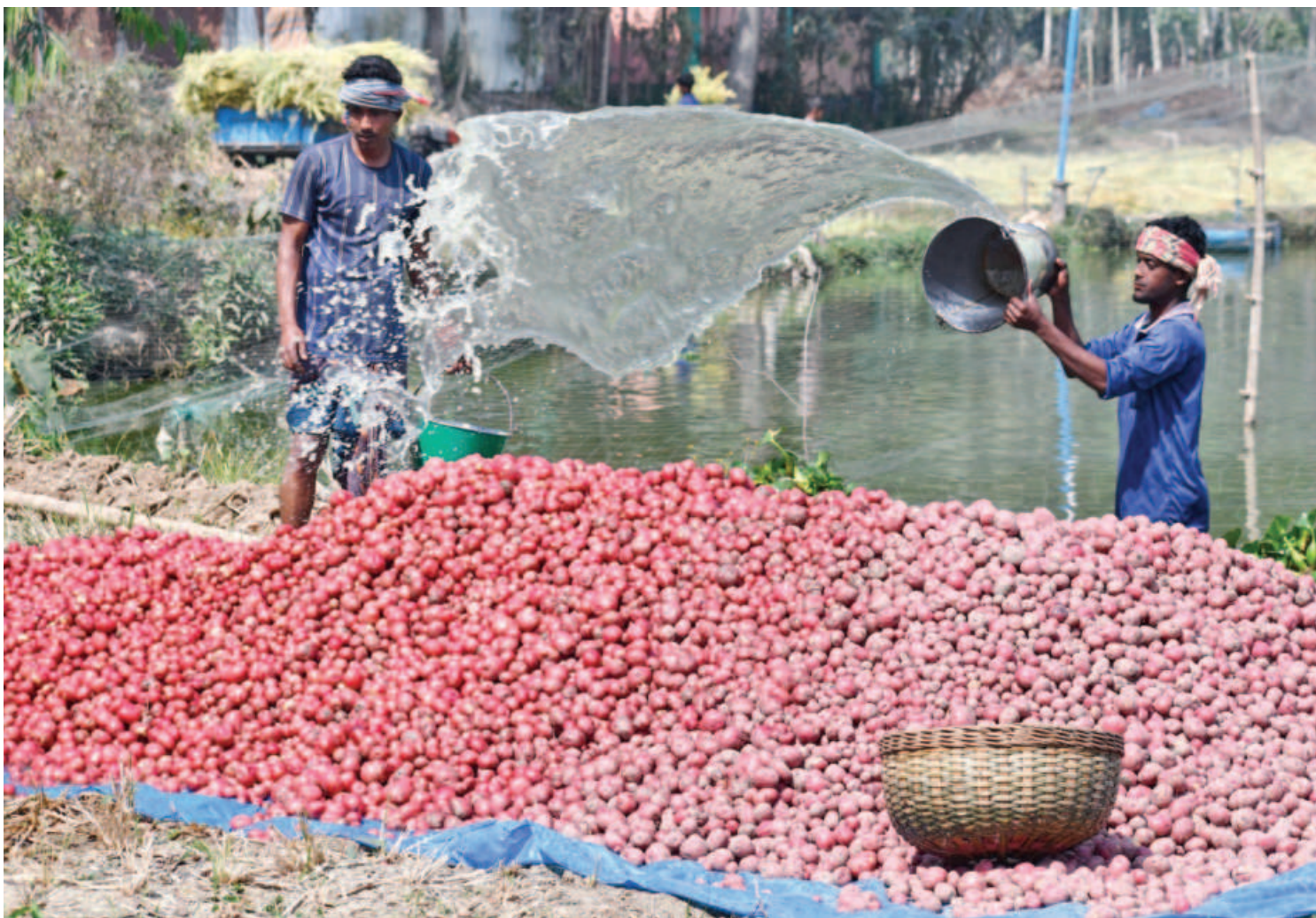
Farmers wash freshly harvested potatoes beside a pond in Gobindaganj upazila of Gaibandha, as growers struggle to sell amid a supply glut that has outpaced demand this year.

While US Secretary of State Marco Rubio said Iran's proposal was "better than what we thought they were going to submit", he insisted any eventual deal had to be "one that definitively prevents them from sprinting towards a nuclear weapon".