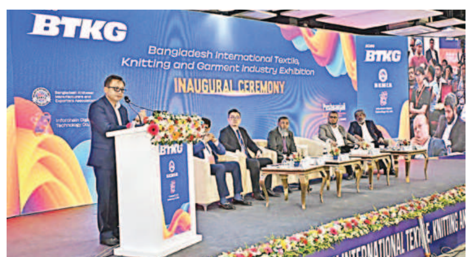
Commerce Minister Khandakar Abdul Muktadir speaks at the inaugural ceremony of the four-day international textile, knitting and garment industry exhibition, titled "BTKG Expo 2026", at the International Convention City Bashundhara (ICCB) in Dhaka yesterday.

The minister said the government is taking steps to simplify licensing