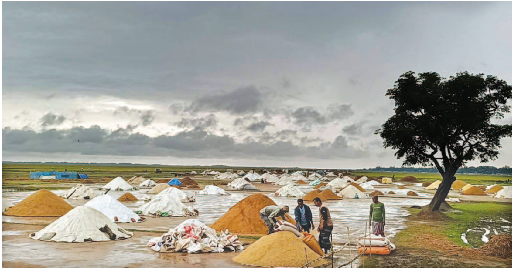
Under a sky heavy with clouds, farmers in Matian Haor of Tahirpur race against the clock to bring home their golden paddy before the impending rains. For them, the harvest is more than grain -- it's the lifeline that sustains the family. In Sunamganj's haor belt, uncertainty hangs as the looming flash flood forecast threatens to wash it all away.