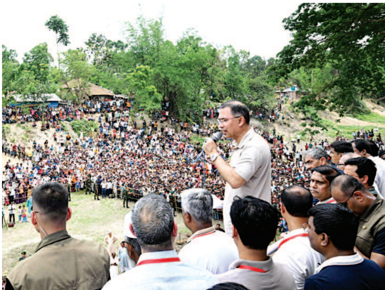
Prime Minister Tarique Rahman addresses a public rally organised by the district unit BNP at the Jashore Eidgah ground yesterday afternoon.