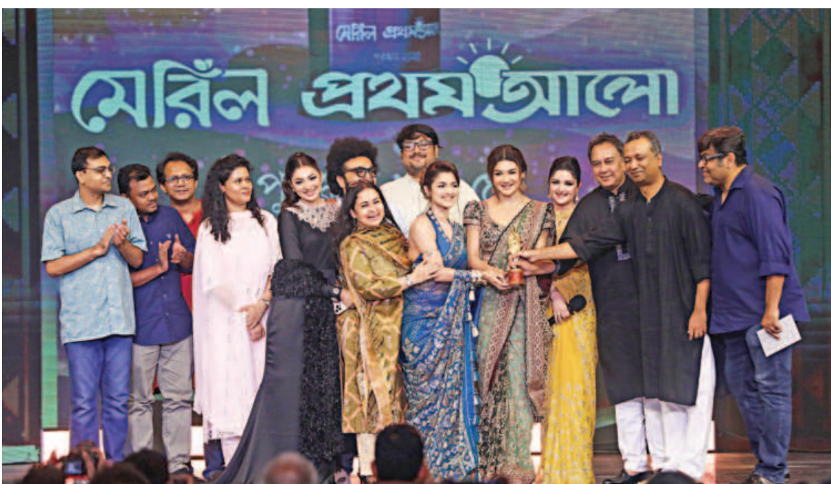
Team ‘Utshob’ wins Best film Award