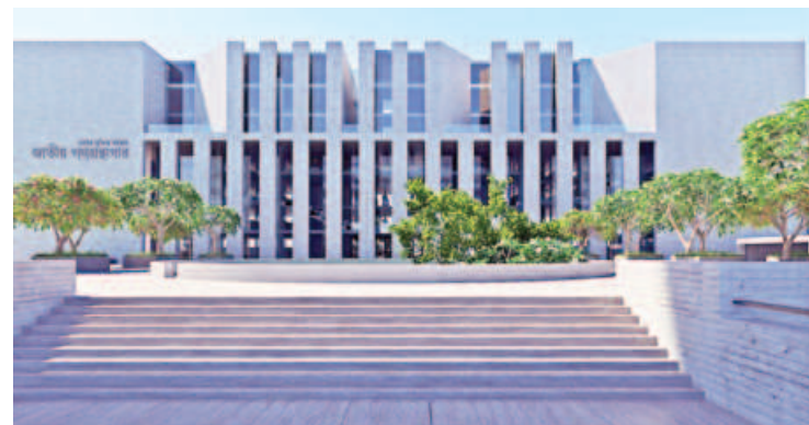
A design of the national library.

The authorities could acquire new land and construct new public libraries instead of demolishing the old ones, he added.