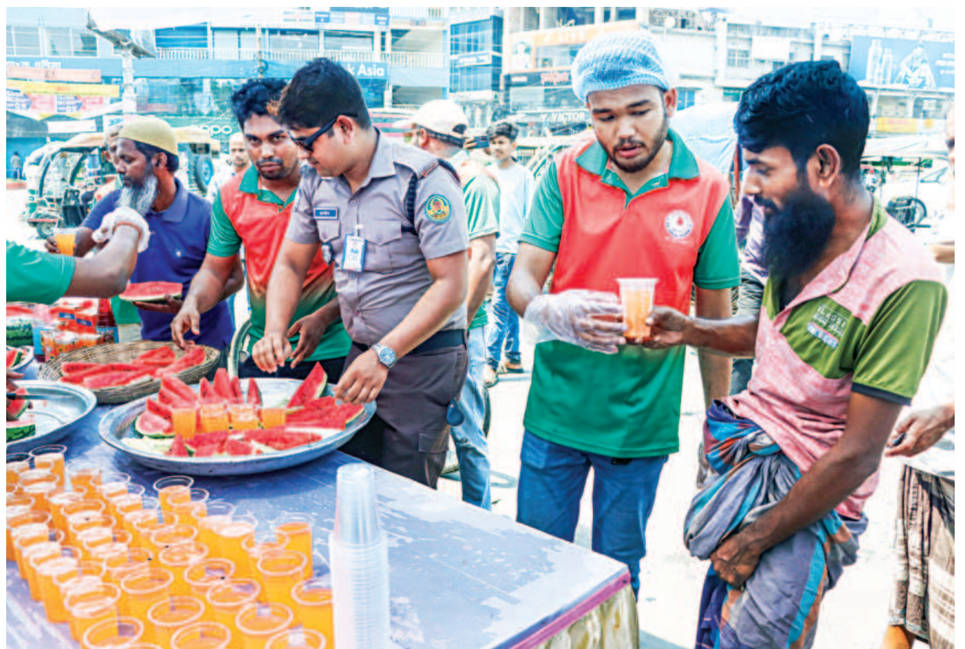
Volunteers distribute cold juice and refreshing watermelon to people working under the scorching sun -- including rickshaw-pullers, pedestrians, and day-labourers -- to help them stay cool and hydrated. A police officer is helping them. The photo was taken at Shibbari intersection in Khulna city yesterday.