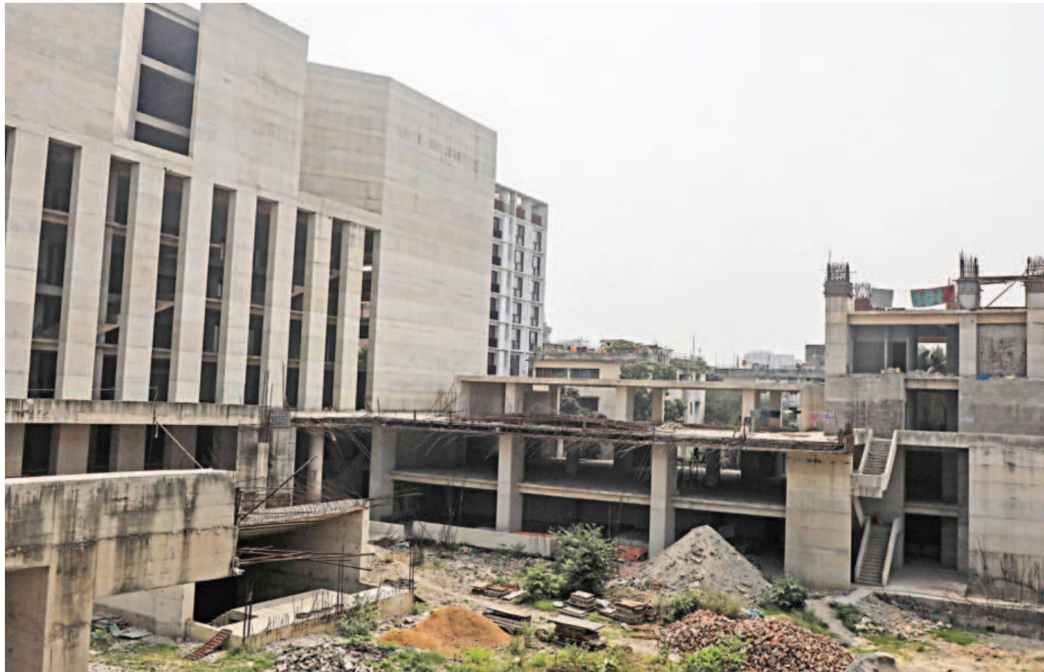
The project to modernise Sufia Kamal National Public Library, originally scheduled for completion in December 2024, saw significant delays stemming from design-related complications. The photo was taken yesterday.