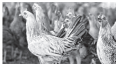
Traders attribute the decline to a reduction in bird flu mortality rates at farms. Narsingdi-based supplier

However, prices remain well above the Tk 280-320 per kg range seen at the start of March.