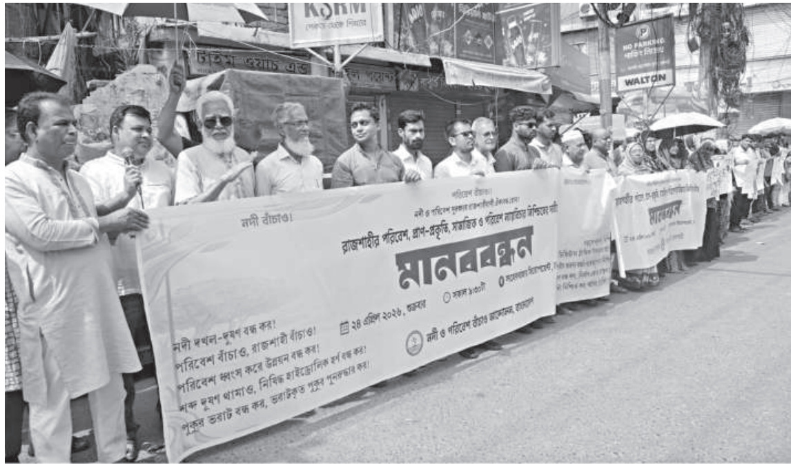
Environmental activists and locals form a human chain at Rajshahi's Saheb Bazar Zero Point yesterday, demanding an immediate halt to river encroachment, pond filling, and noise pollution.

জমি বিক্রয় পুরাতন নান্দনিক পরিবেশে আইকনিক টাওয়ারের পাশে ২০ নম্বর সেক্টরে ৫ কাটার একটি প্রুট বিক্রি হবে। সেবারা ০১৯৯২-০৭৭০৩৪, ০১৯৯২-০৭৭০৩৫