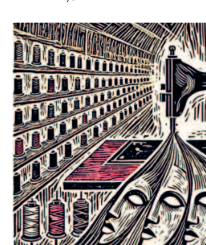
VISUAL: ANWAR SOHEL

Aside from fair wages, automation introduced new types of psychological and emotional stress. Integrating automated systems raises productivity goals and stricter performance monitoring, creating an environment of pressure and anxiety. Workers report feeling overwhelmed by the need to meet unrealistic expectations while adapting to new technologies. Additionally, while automation