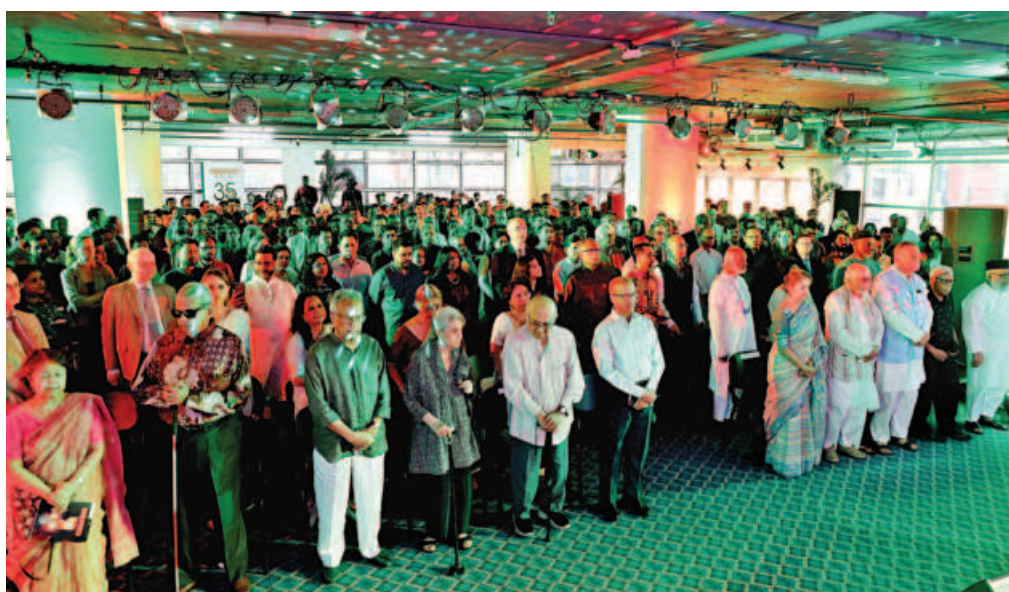
Guests stand for the national anthem, followed by a one-minute silence in remembrance of those who laid down their lives for the country during the 1971 Liberation War, the 1990 anti-autocracy movement, and the July 2024 mass uprising, and also for the victims of the Rana Plaza tragedy.