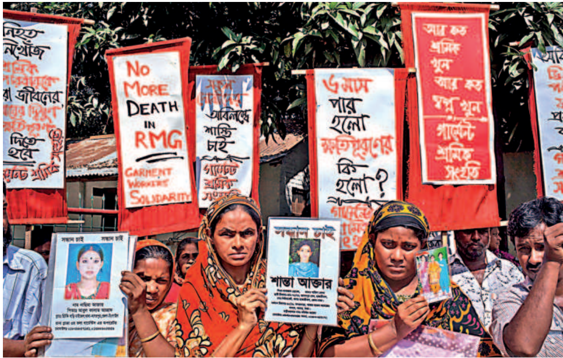
▲ Relatives of Rana Plaza victims protest to demand justice and fair compensation.