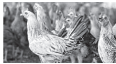
Traders attribute the decline to a reduction in bird flu mortality rates at farms. Narsingdi-based supplier

However, prices remain well above the Tk 280-320 per kg range seen at the start of March.