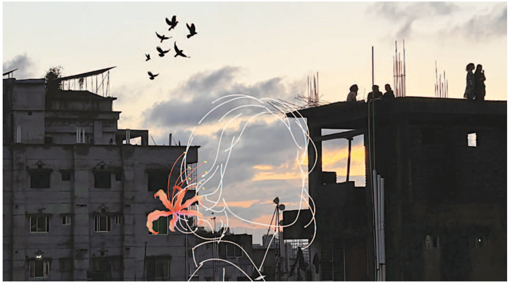
ILLUSTRATION: MAHMUDA EMDAD

The rooftop is where she breathes. It is a square of cracked concrete five stories above the noise of Dhaka, and it belongs to no one. Or perhaps it belongs to everyone and no one at once—a space unsupervised, unspoken, unscripted. Up here, the air is thick with the sound of pigeon wings and the far-off scent of turmeric frying in someone's kitchen. Up here, Asha can be someone else. Or, more precisely, she can be herself. She leans against the rusting water tank, barefoot, listening to the city hum beneath her. A motorcycle backfires on the street below. A woman calls for her son. A faint azaan echoes from a distant mosque. The sky is a bleached grey, promising rain, but delivering nothing. It is just after Maghrib, and Asha knows her mother will be calling soon. But she stays. She is 21 and unmarried, which, in her building, makes her either tragic or dangerous, depending on whom you ask. In the flats below, the women watch her closely—especially the widows. They nod at her in the elevator, but it is always a cautious nod, wrapped in disapproval. They do not like her lipstick, or how she laughs too loudly when boys pass by on the street, or how she does not cover her hair when she goes to buy bread. They do not understand why a girl like her lives alone.