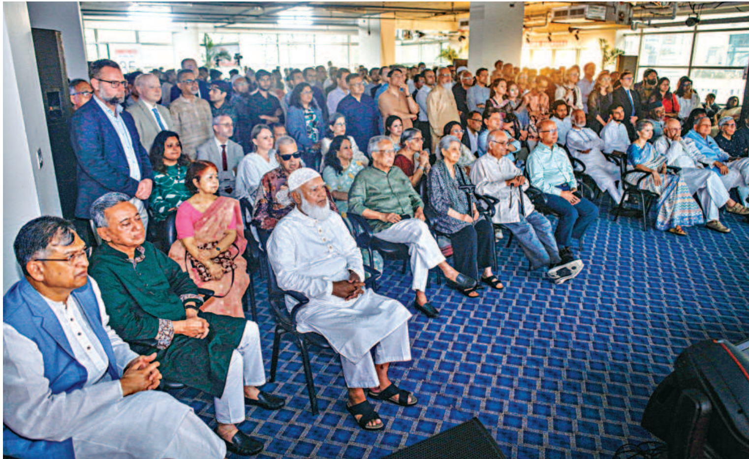
Ministers, opposition leaders, diplomats, businesspeople, and members of the civil society, among other guests, attend The Daily Star's 35th anniversary celebrations.