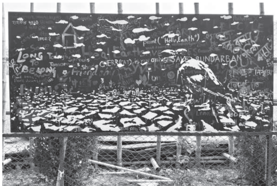
Earth Day 2026 celebration at ULAB.

Some might look at these 38 programmes—the talks, the walks, and the workshops—and see them as fleeting, like the leaf alpona . Then again, they were designed with care, with a hope that the ideas would be blown away by the breeze to germinate in other places. Through the GI based plantation or the discussion on green governance, we have started training a generation of leaders who should not be fooled by "greenwashing." We want them to know that a glass bottle filled with water that arrived in plastic is a lie. We want them to know that green labels used as a bargaining chip by the West are a lie. The real sustainability comes from our own culture, our own memory, our own heritage. These products may resemble a soap bar made from plants or artwork created by an artist using dried leaves. We have started nurturing the imagination needed to tackle the planetary crisis. We have started a green convo to know our planet and our power, the motto of this year's Earth Day.