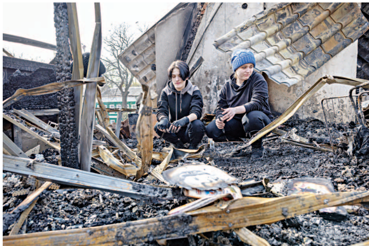
Residents look for their belongings in their flat, a three-storey residential building destroyed after a Russian drone attack in Odesa yesterday. Two people were killed and fifteen were wounded in the attack.

Her sentence was commuted by one-sixth as part of an amnesty last week for thousands of prisoners that included the release of her ally, Win Myint, the ousted former president. Min Aung Hlaing led the coup that ended a decade of tentative democracy in Myanmar and triggered mass protests and a civil war, prompting an intervention by Asean and its exclusion of the then ruling generals from its summits.