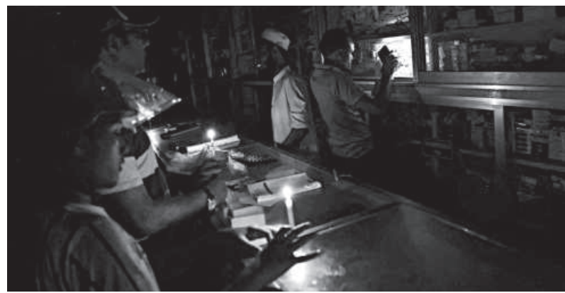
Urban centres in Bangladesh, particularly Dhaka, continue to receive relatively stable electricity supply with shorter outages, while district towns and rural areas face longer and more frequent interruptions, often spanning hours.

District towns and rural areas face longer and more frequent interruptions, often stretching into hours. In Rajshahi, Rangpur, Barishal, and Sylhet's peripheral upazilas, rural outages now routinely stretch from 8-13 hours a day. Half-day shortages are becoming increasingly normal in some areas. Even within the same administrative regions, urban centres tend to remain relatively stable while the surrounding unions bear the heavier burden. A similar imbalance is visible in industrial zones: Gazipur and Narayanganj, for example, are prioritised to keep production running, whereas nearby rural belts absorb longer cuts.