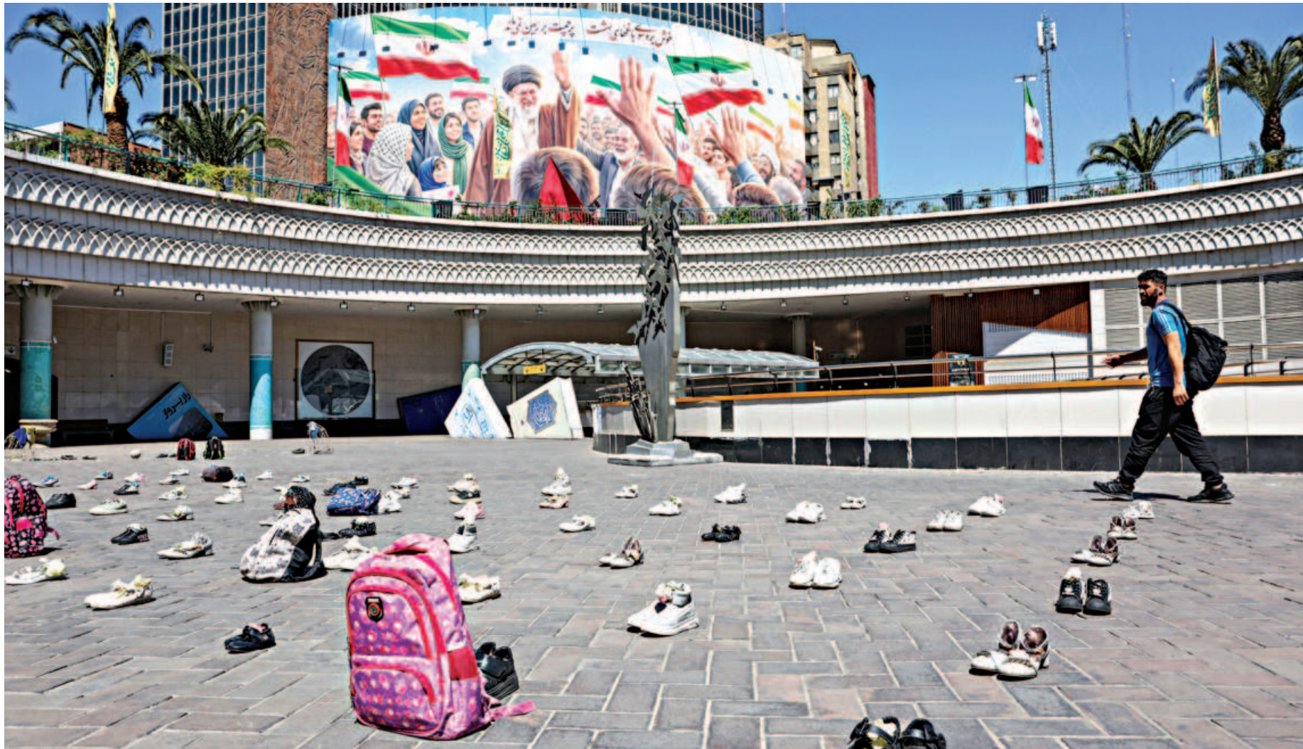
An Iranian man walks past symbolic belongings laid on the ground at Valiasr Square in Tehran yesterday, in tribute to the schoolgirls in Minab killed in an airstrike. The airstrike hit a primary school in the southern Iranian city on the first day of the war, killing at least 170 people, including students and teachers.