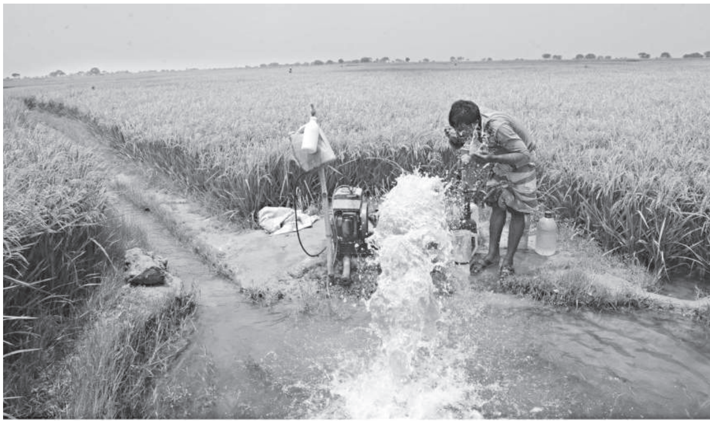
A farmer collects drinking water under the blazing sun at Madhyachar in Char Majhardia, Rajshahi, where 28 varieties of rice are ripening on thousands of bighas of land. With diesel shortages crippling irrigation, farmers struggle to water their crops, queuing for oil and enduring drought conditions on the Padma char. The photo was taken yesterday.

Confirming the incident, OC Ataur Rahman of Sreepur Police Station said the car has been seized and legal steps were underway.