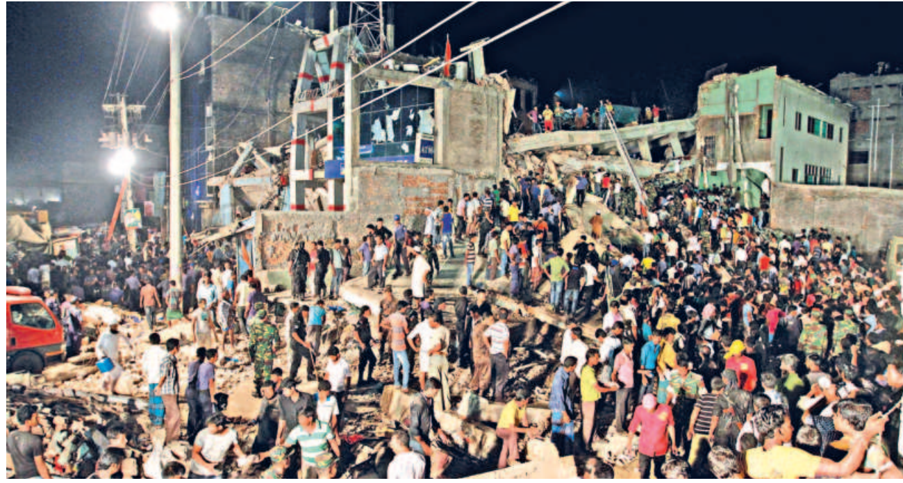
A scene of devastation at the Rana Plaza site in 2013, marking a catastrophic failure of industrial safety that claimed 1,175 lives.

On April 24, 2013, 1,175 lives and thousands of dreams were crushed beneath the rubble of the Rana Plaza building. According to Hajar Praner Chitkar (2015, Bangladesh Garment Sramik Sanghati), 1,175 people died and 162 went missing, while around 2,500 were injured or permanently disabled. This is a date that cannot,