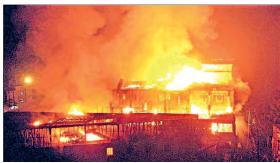
The 2006 KTS factory inferno remains a haunting precursor to Rana Plaza, exemplifying a decades-long failure to transform "collective empathy" into the permanent, legally-enforced safety standards the nation still lacks.

Through the Accord on Fire and Building Safety and the Alliance for Bangladesh Worker Safety, a multinational initiative