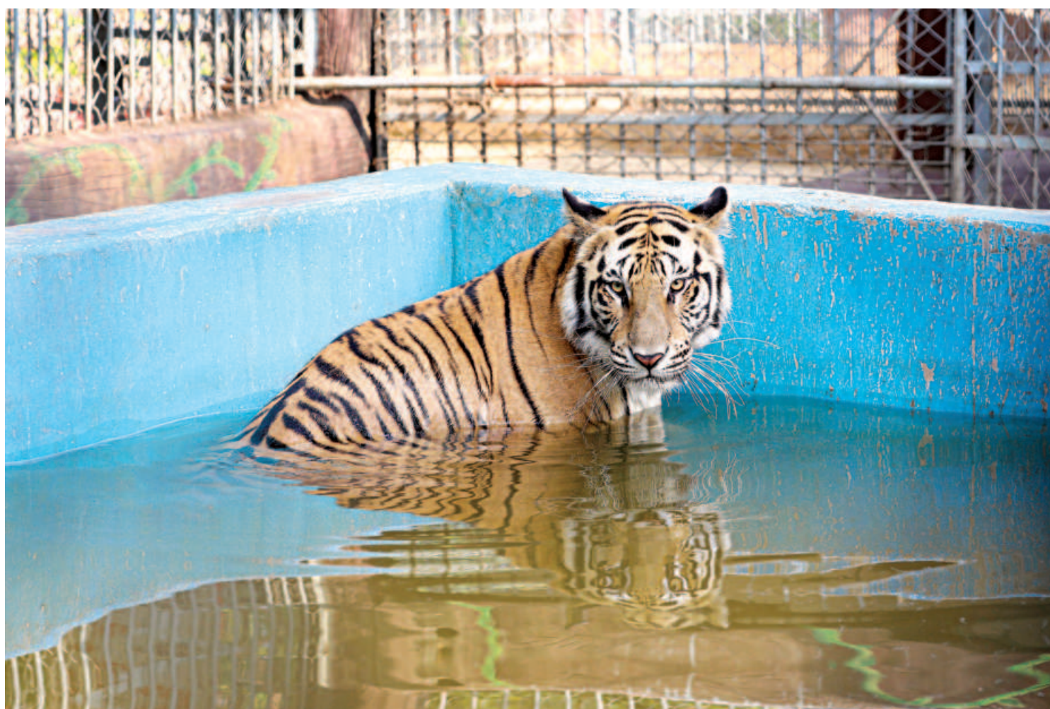
A tiger cools off in a water trough at Chattogram Zoo to escape the scorching heat. Other animals in the zoo are also struggling amid the intense temperature. The photo was taken recently.