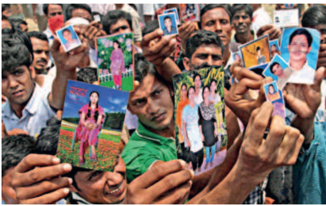
Relatives display portraits of the missing and deceased, symbolising the irreparable human cost and the ongoing struggle for accountability.