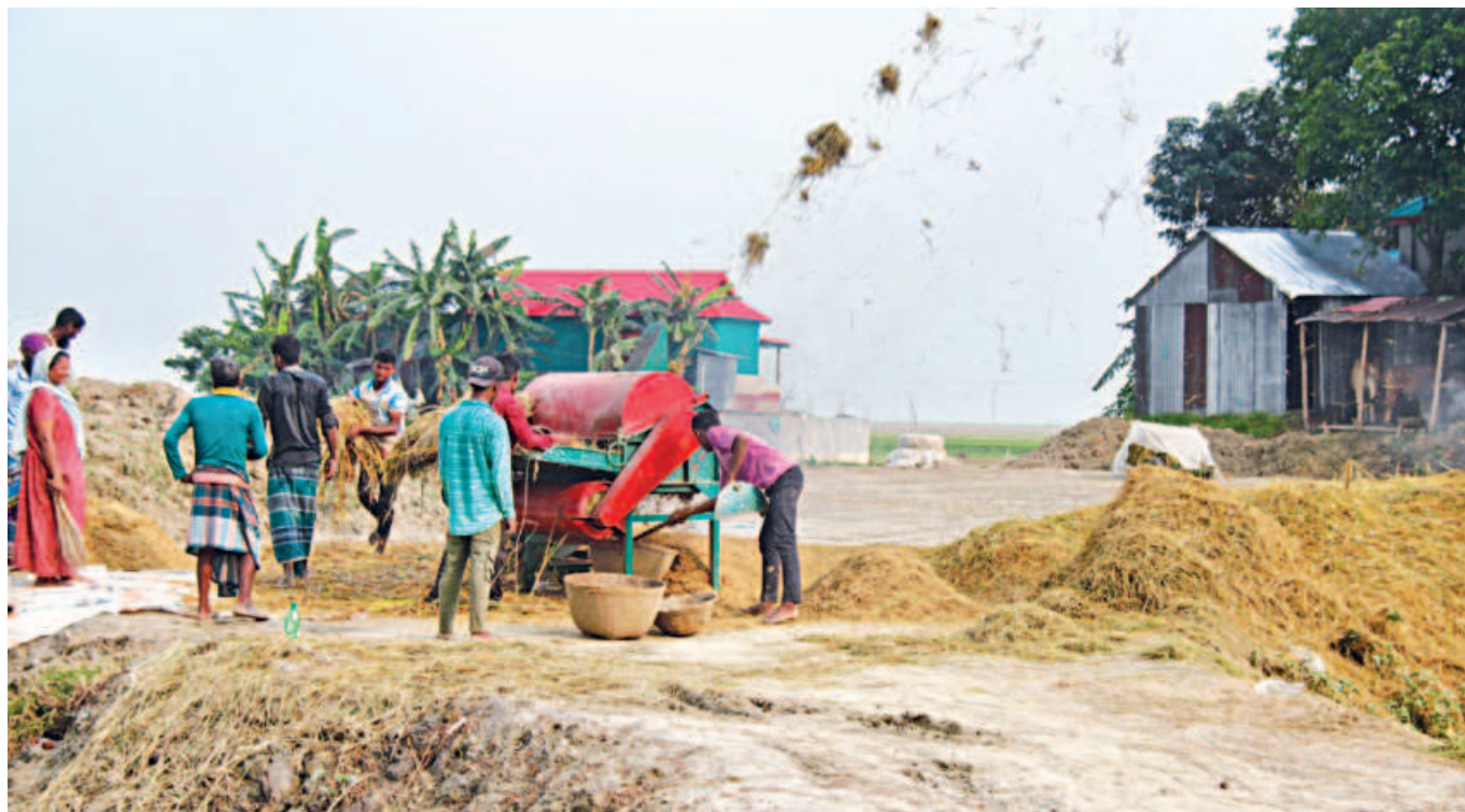
Straws scatter into the air as farm workers feed bundles of freshly harvested boro paddy into a threshing machine to separate the grains. The rice, still in its husk, will go on to be boiled in large steel pots to make later processing easier. The photo was taken yesterday in Itna upazila of Kishoreganj.

Inside the camp, many believe that information