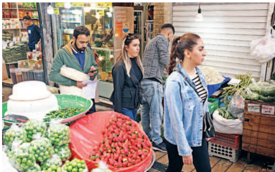
Iranians shop for fruits and vegetables in a market in northern Tehran on April 21, amid a ceasefire in the region.