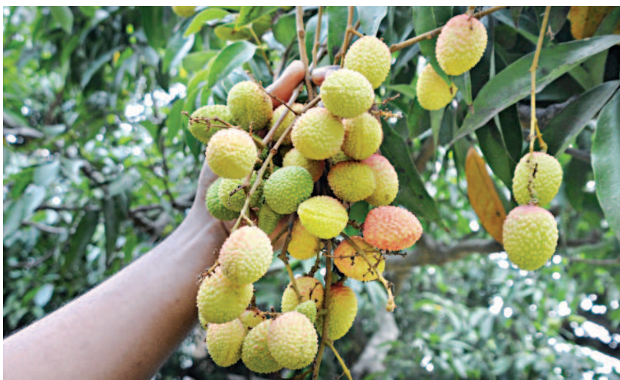
Local litchi in Rajshahi have begun ripening, but intense heat and dry weather are causing the fruits to crack despite earlier rainfall in the region. The photo was taken at an orchard near the Faculty of Fine Arts at Rajshahi University recently.