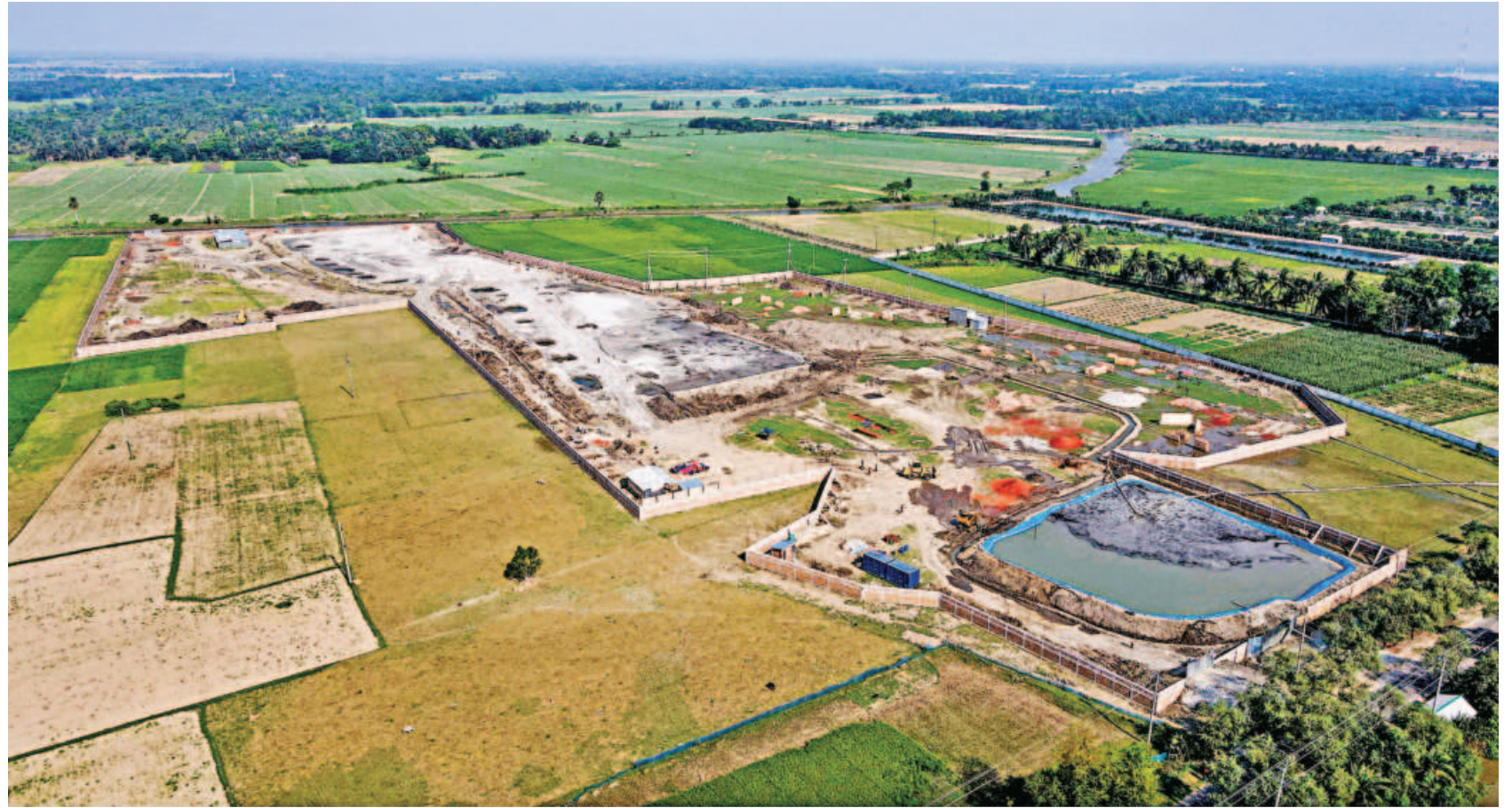
A factory is being built on farmland in Debitala of Khulna's Botiaghata upazila, raising concerns among locals and farmers about its impact on arable land. Locals fear the loss of farmland will threaten the livelihoods of those dependent on agriculture. The photo was taken recently.