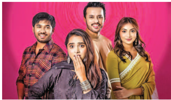
Cast of 'Eta Amaderi Golpo'

To be honest, when I began working on it, my only intention was to create something meaningful. I never imagined it would receive this much love or be embraced so widely. The fact that viewers have found reflections of their own lives in the story is what has taken it this far. For that, I am truly grateful.