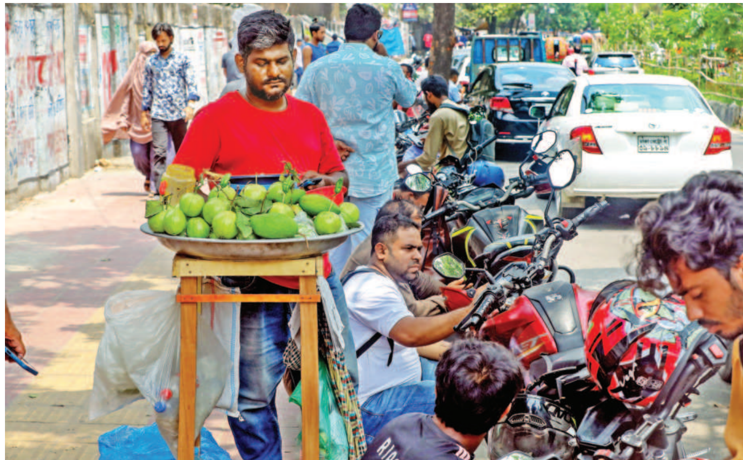
A mobile food vendor selling guava to people waiting in long queues for fuel in the capital's Nilkhet, turning the crowd into a temporary market. Vendors say they are earning Tk 2,500-3,000 a day with modest profits, but worry the business will disappear once the queues ease.