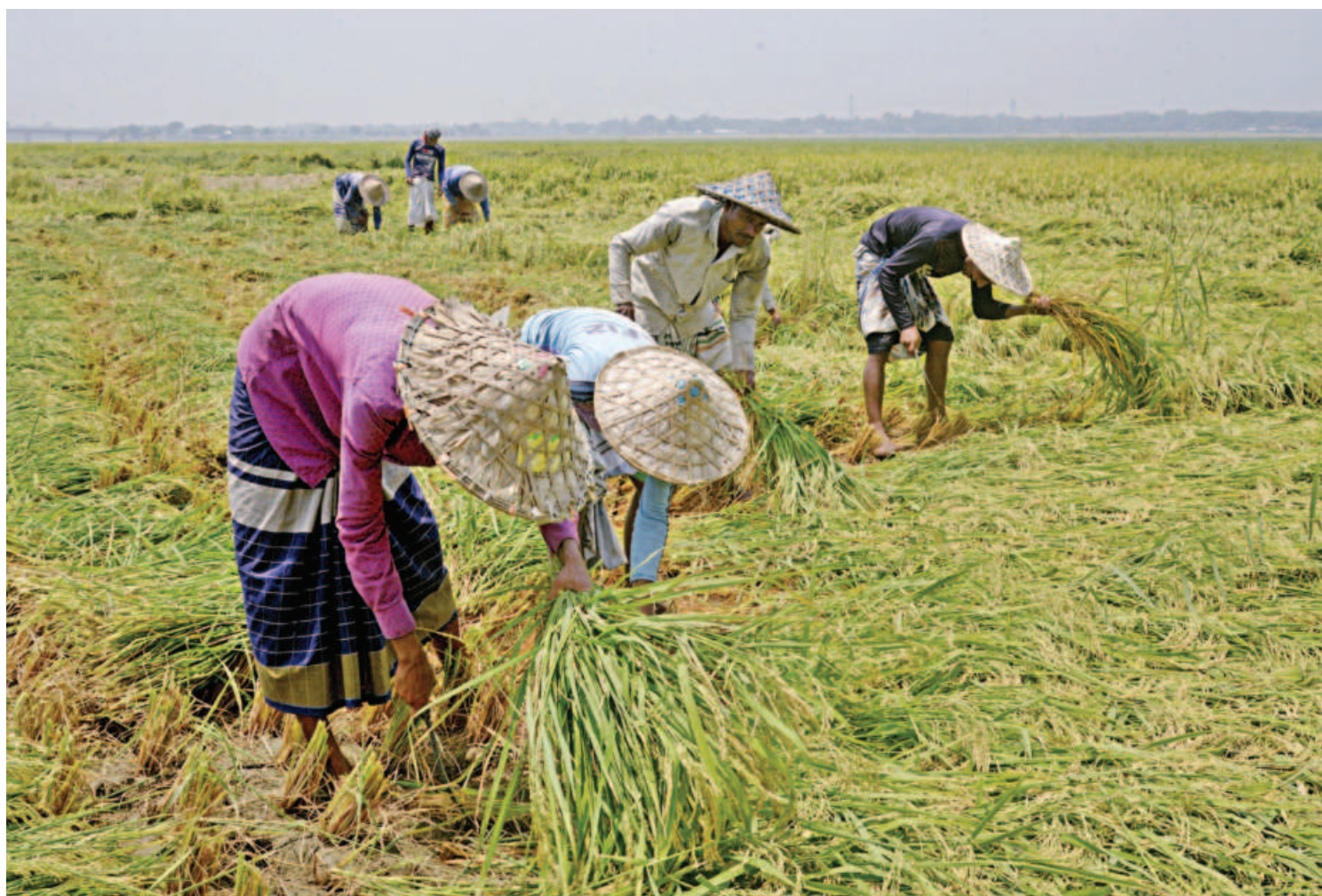
Farmers harvest Boro paddy on the dried-up Shib river in Tanore upazila of Rajshahi. Wearing traditional hats, they toil under the scorching summer sun, anxious about possible losses from hailstorms and not getting a fair price for their produce. The photo was taken yesterday.