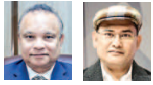
Ziauddin Saimum STAFF CORRESPONDENT

The government has appointed two special assistants to the prime minister, assigning them portfolios in health and environment, according to separate gazette notifications issued by the public administration ministry yesterday.