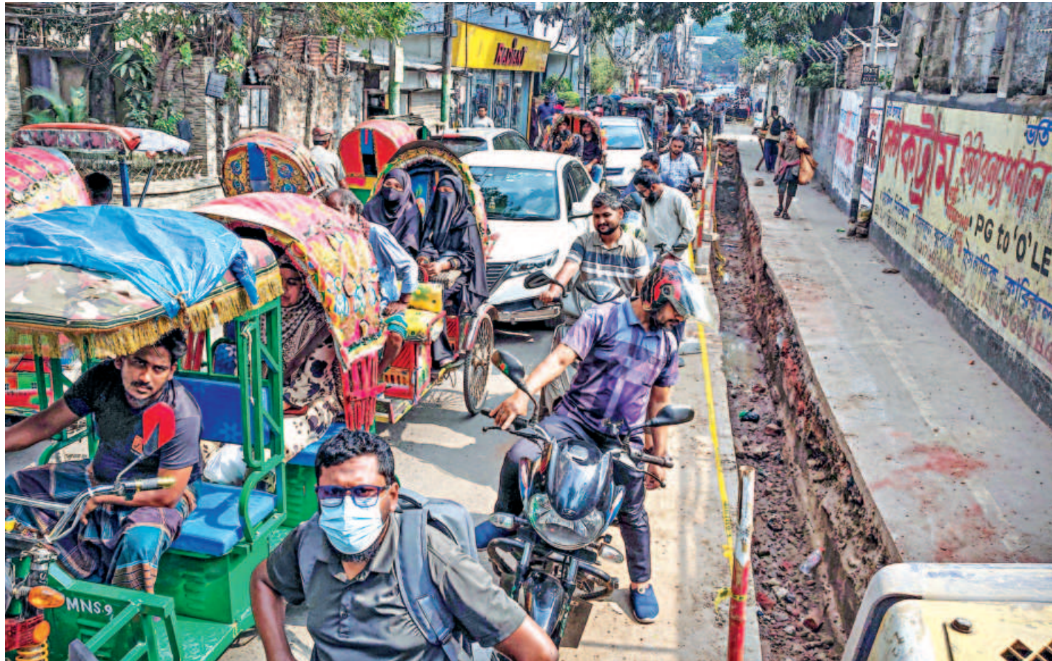
People stuck in traffic under scorching heat on a narrow street in Segunbagicha in Dhaka yesterday. Bikers occupy one lane while queuing for a nearby petrol pump, and roadwork by Dhaka South City Corporation has excavated another, leaving little space for commuters.