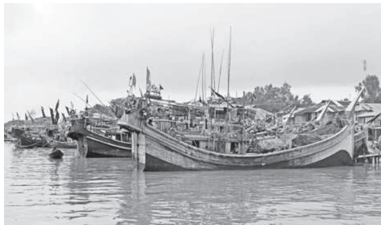
Trawlers remain anchored in Mohipur-Alipur fish landing station area in Patuakhali.

Debt is rising and fish stocks are declining. I am thinking of leaving this profession and learning to drive a rickshaw," Faruk added.