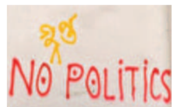
A graffiti at DU.