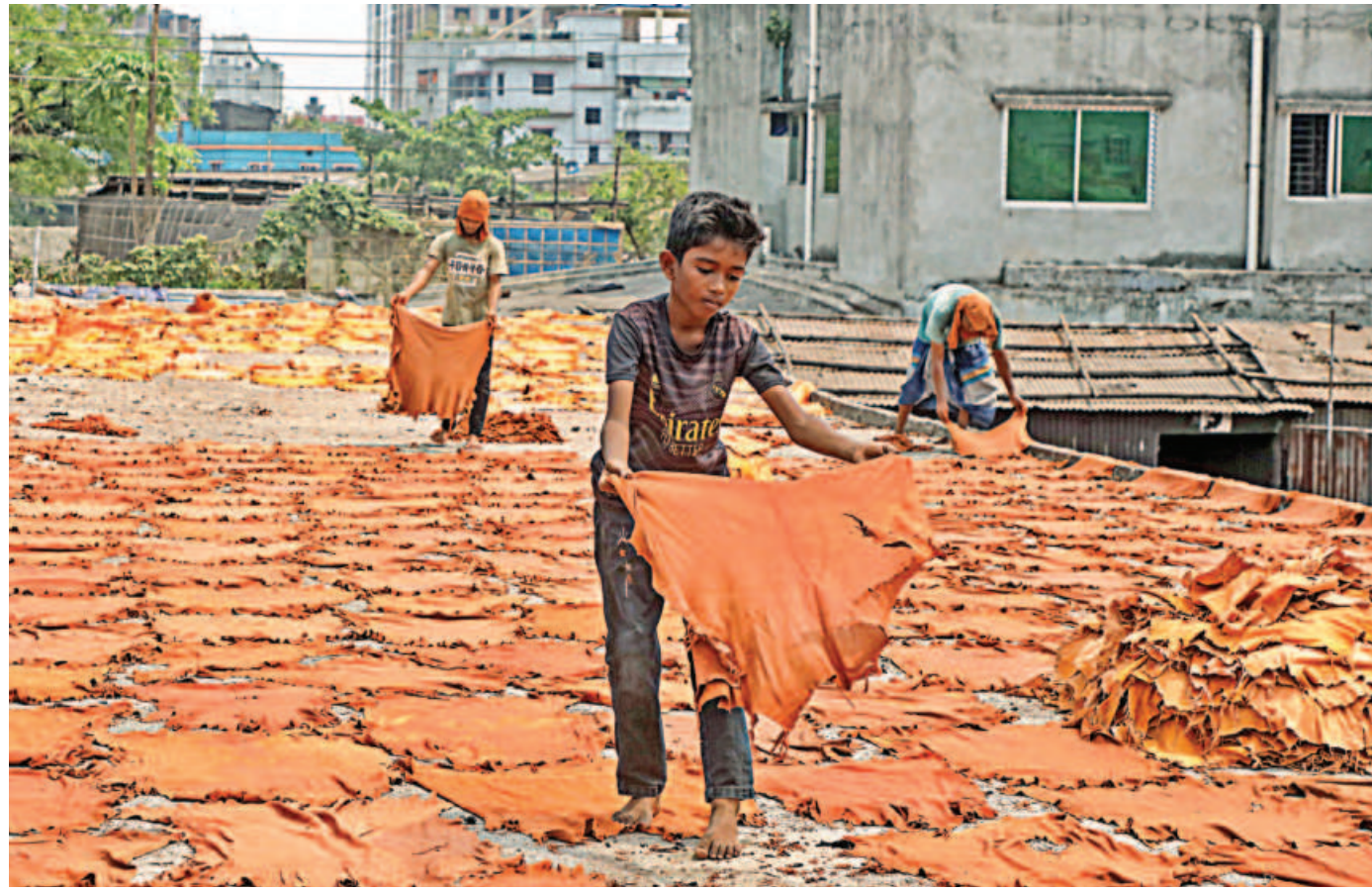
A young boy lays out dyed leather sheets at a tannery in the capital's Hazaribagh, highlighting the persistence of child labour in hazardous conditions. Although tannery factories were relocated from Dhaka to Savar's Hemayetpur due to environmental concerns, smaller operations, warehouses, and leather processing activities continue in Hazaribagh, including dyeing, drying, chemical use, and storage. The photo was taken recently.

A Special Tribunal for Prevention SEE PAGE 8 COL 5