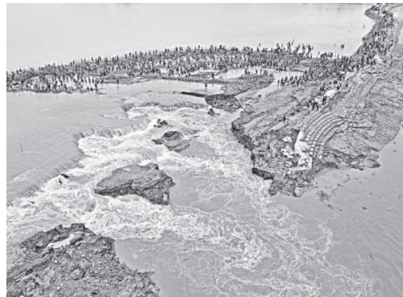
Overflowing river water washed away part of a coastal dyke in Khulna during the devastating flood of August 2024.

to manage flood risk. Traditionally, flood management relied on levees, dams, and channel modifications. However, these approaches often accelerated water flow, transferring risk downstream rather than reducing it. NbS, on the other hand, seek to retain water within the landscape by absorbing it, slowing its flow, and spreading it out. In Australia, this approach centres on restoring wetlands, reconnecting rivers with their floodplains, and reinforcing