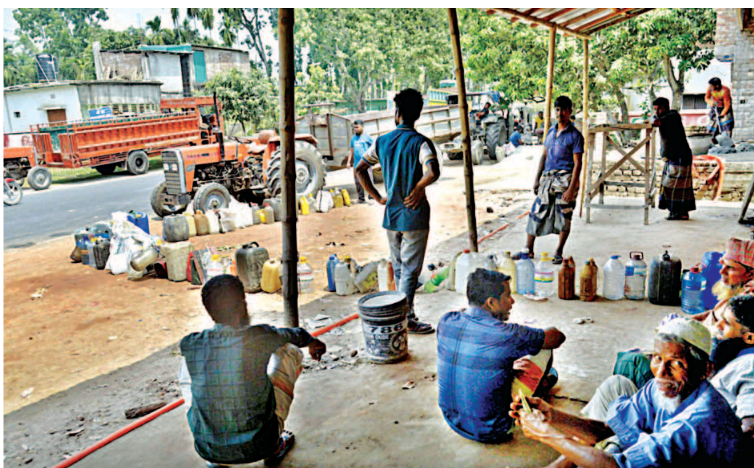
Farmers queue with containers and tractors at a filling station in the Medical Intersection area of Rajshahi's Mohanganj yesterday as they continue to struggle for fuel amid a nationwide crisis triggered by the Middle East conflict.