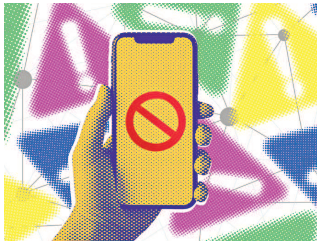
ILLUSTRATION: ABIR HOSSAIN

Australia became the world's first country to ban social media for children. Several other nations are considering similar restrictions. As the prospect continues to gain significant momentum around the world, it begs the question: what would a similar ban for young users in Bangladesh entail?