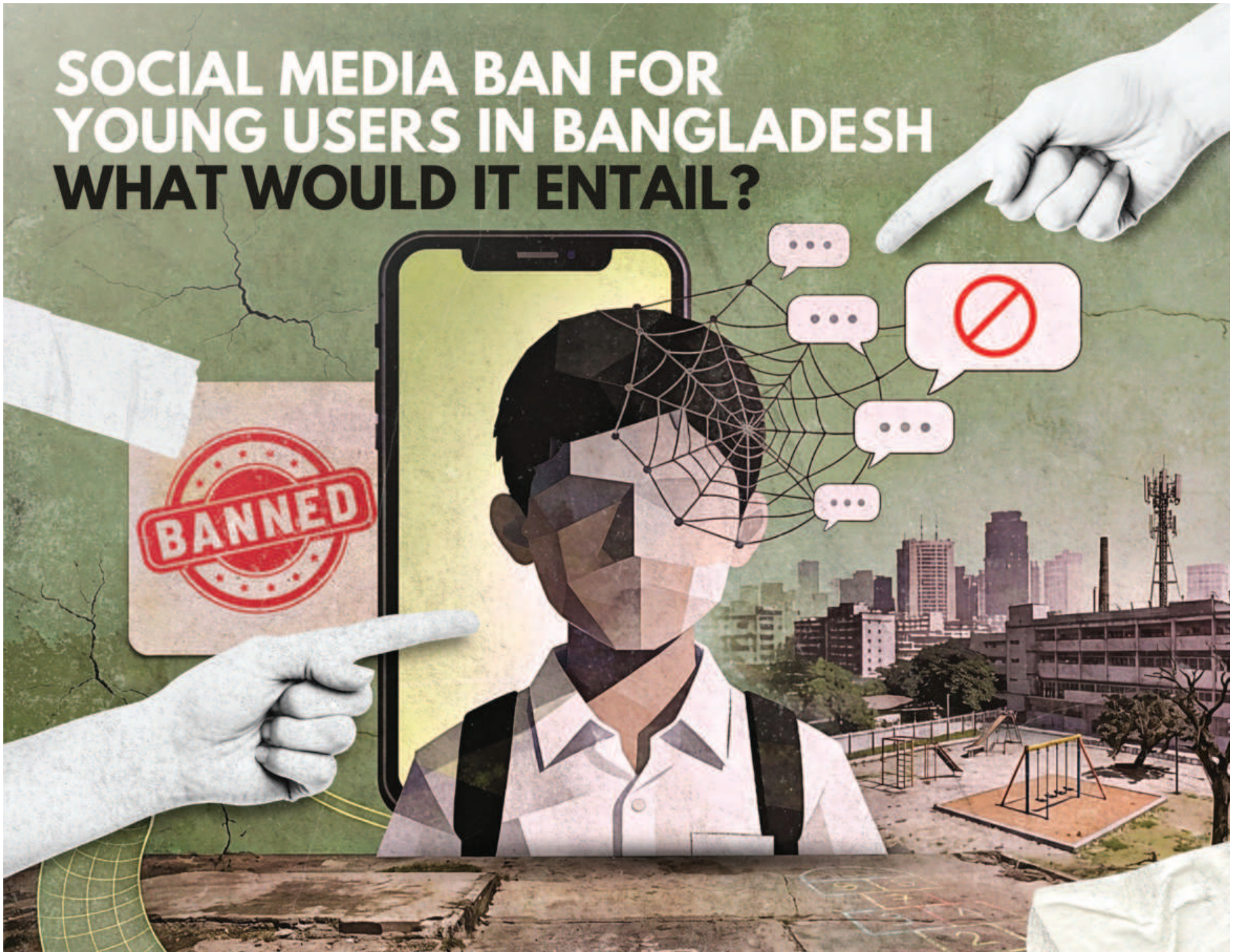
ILLUSTRATION: SALMAN SAKIB SHAHRYAR