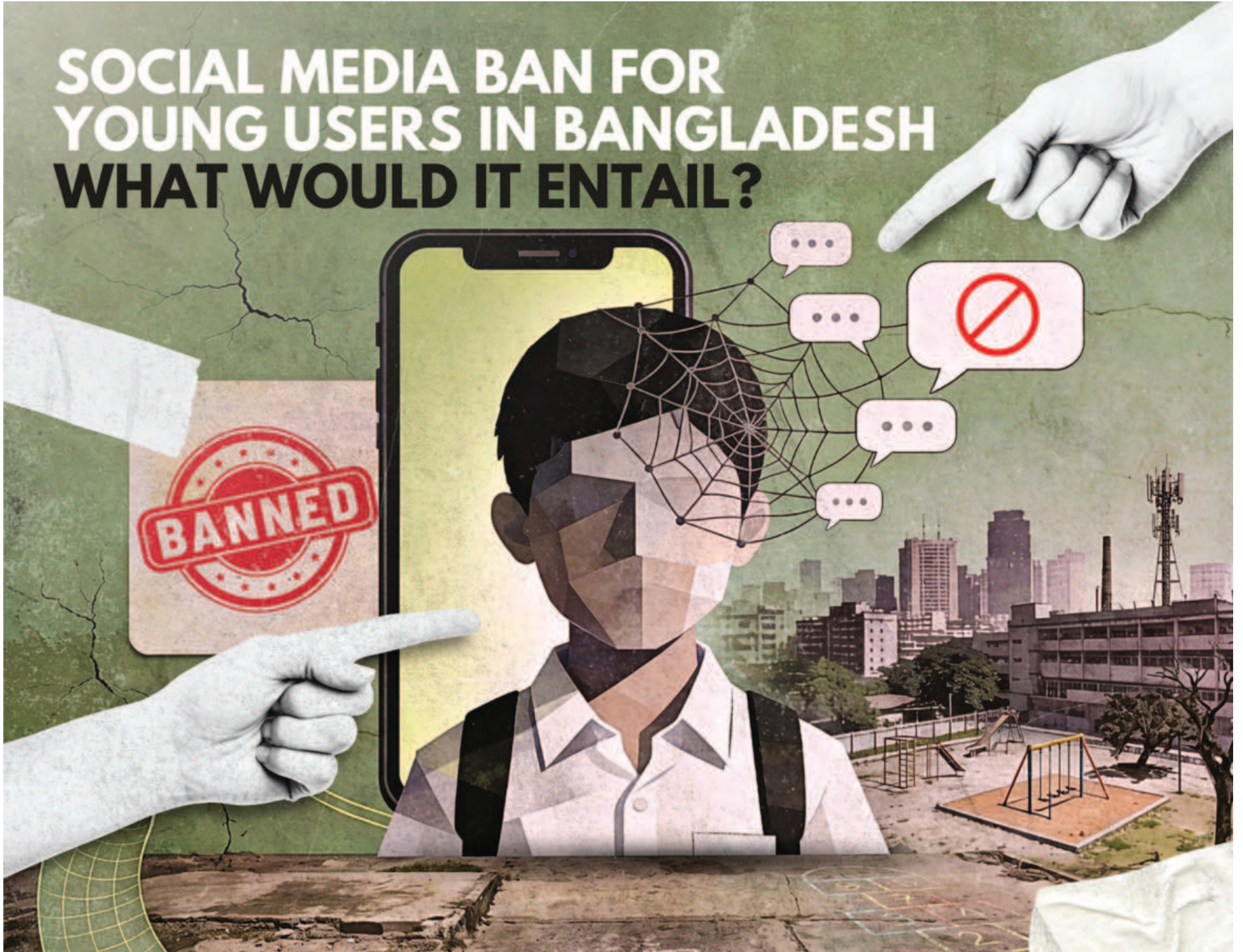
ILLUSTRATION: SALMAN SAKIB SHAHRYAR