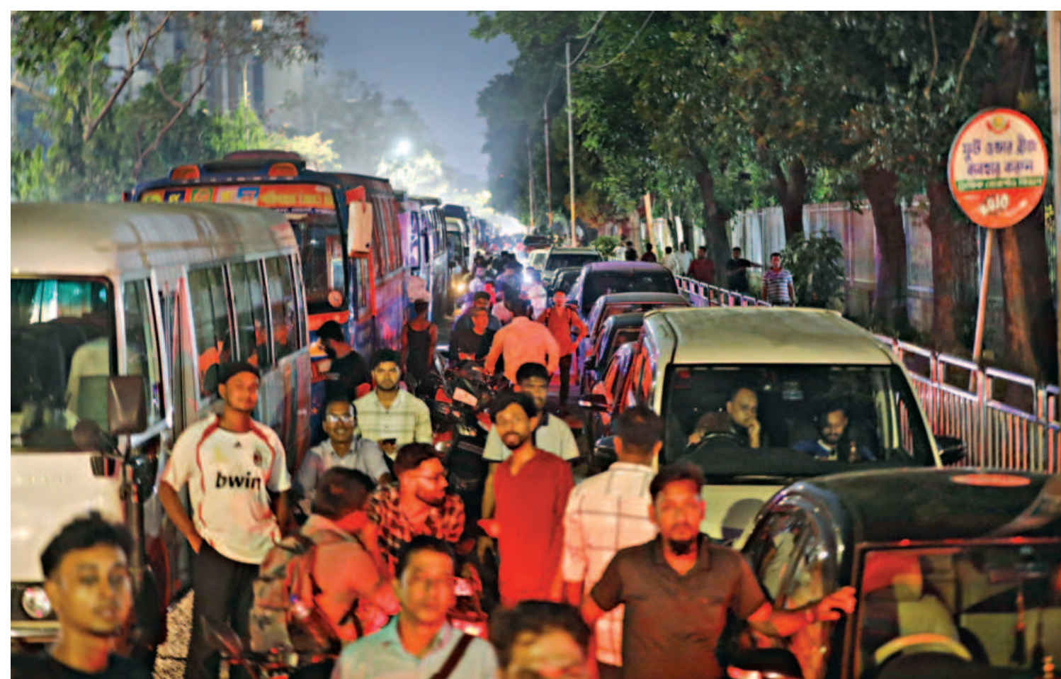
Cars, bikes and heavy vehicles wait in line for fuel outside Talukdar Filling Station at Asad Gate around 9:30pm last night. Pump employees said the queues were slightly shorter yesterday.