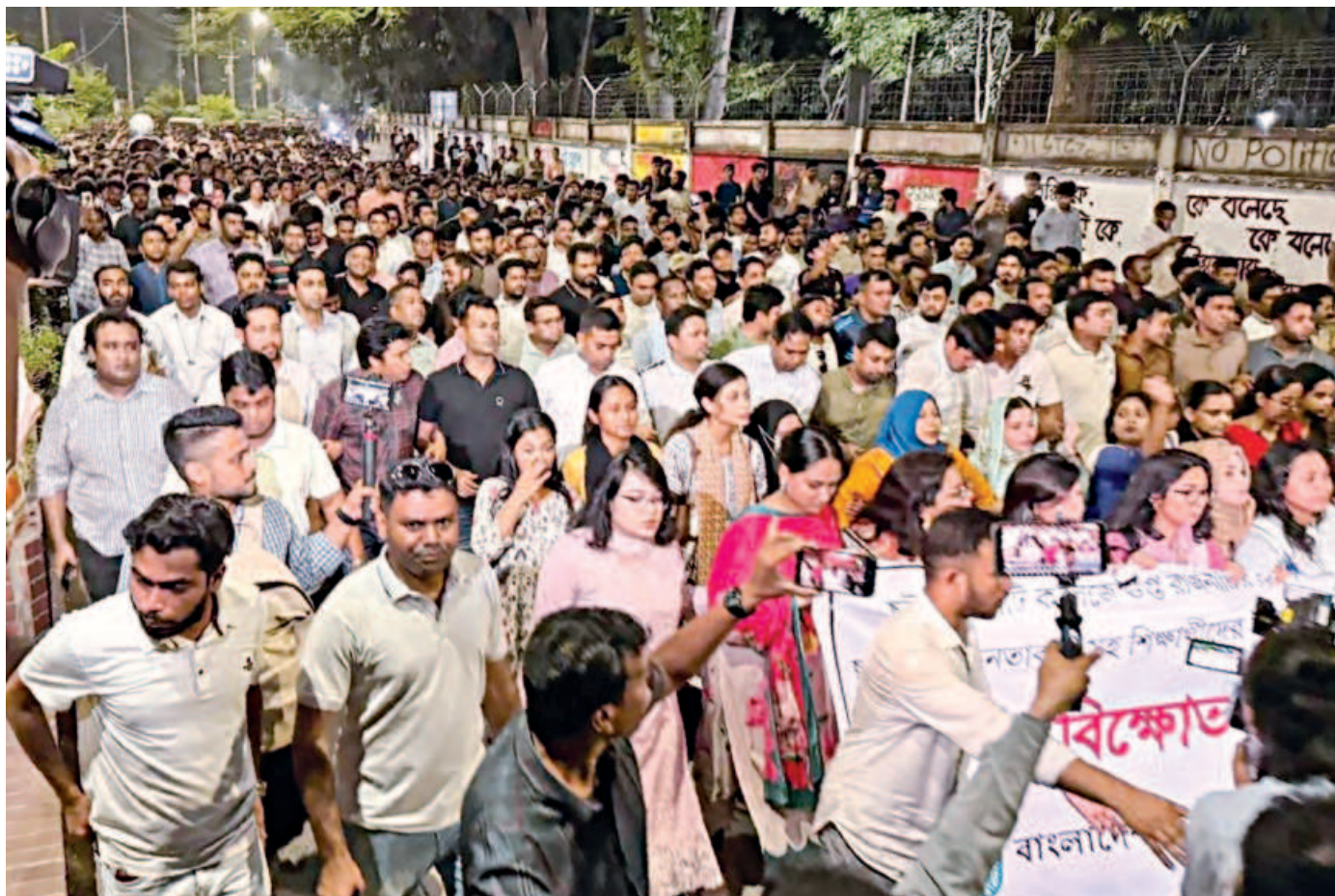
Activists of Dhaka University's Jatiyatabadi Chhatra Dal at a procession from VC Chatter to the Raju Bhaskarja last night, protesting an alleged attack by Islami Chhatra Shibir on general students and JCD activists at Chattogram City College earlier yesterday. Story on Page 3.