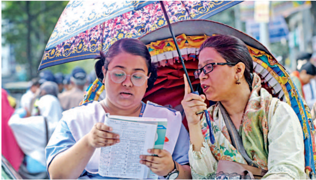
WITH MAA'S GUIDANCE ... Clutching her notes, an SSC examinee does last-minute revisions as her mother leans in, guiding her under a shared umbrella on a parked rickshaw just outside Motijheel Government Girls' High School exam centre in Dhaka yesterday -- a fleeting moment of care and hope before a major academic milestone.