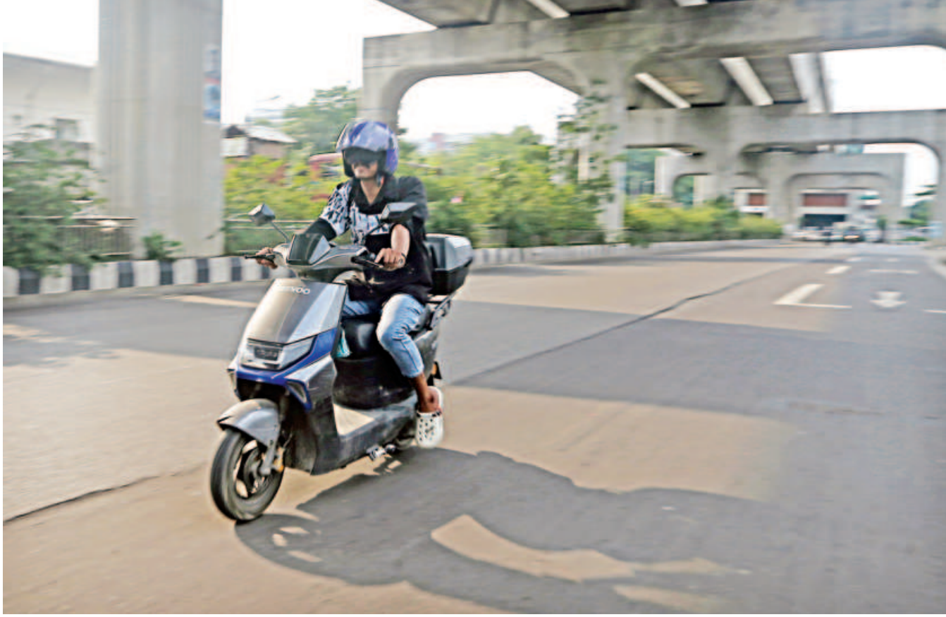
A private firm employee operates his e-bike amid fuel shortages, as many turn to electric vehicles to avoid long waits at pumps. According to industry insiders, monthly sales surged from 800-1,000 units to about 2,200 in March during the fuel crisis and could reach 3,000 if the trend continues. The photo was taken on Sher-e-Bangla Nagar Road in the capital's Agargaon area yesterday.