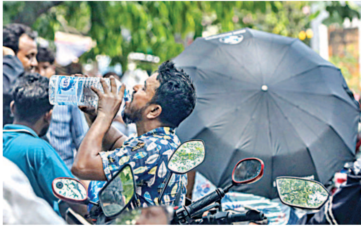
Amid the summer heat, a man cools off and rehydrates with a drink of water after queuing for fuel since 5:00am. By noon, he was expecting to reach the pump around 2:00pm. After Saturday's mid-month fuel price hike, lines outside city pumps yesterday remained long. The photo was taken from the queue at Sonar Bangla Service Station in the capital's Asad Gate area.

Power, Energy and Mineral Resources Minister Iqbal Hassan Mahmood Tuku described the situation as "wartime", noting that global markets