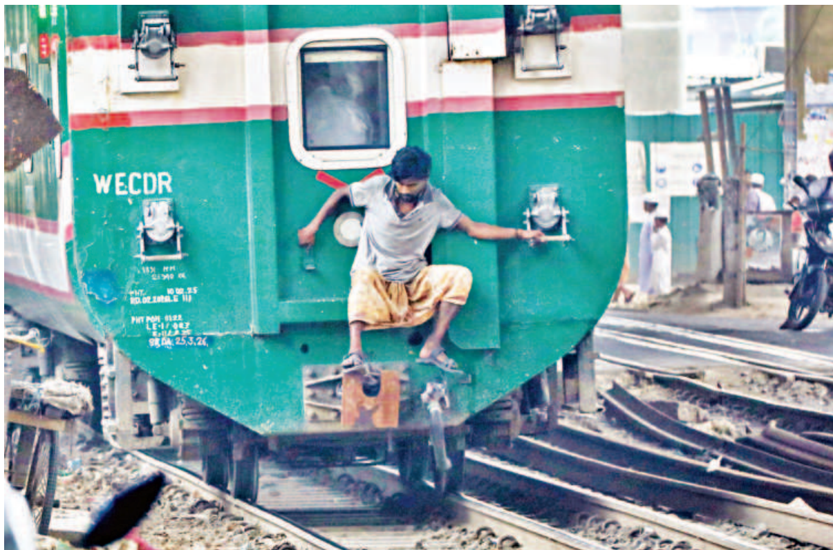
A man clings precariously to the end of a moving train, gripping its metal handles while balancing on the narrow coupler. The risky act highlights the grave dangers of riding outside carriages -- one slip could be fatal. The photo was taken at the Moghbazar level crossing area in the capital.