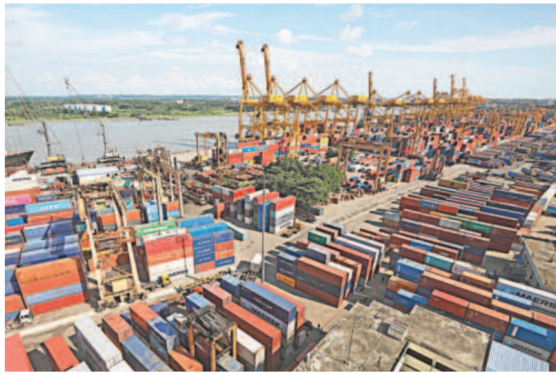
Meaningful trade reforms remain essential to drive growth, create jobs, and ensure sustainable economic stability, said an expert.

Bringing up the garments sector, he said a mix of liberalisation and