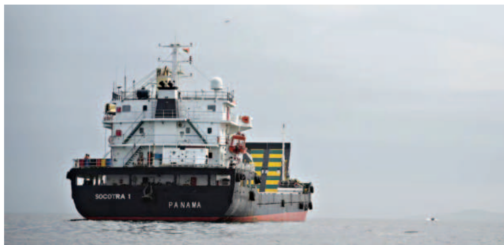
A vessel is seen at the Strait of Hormuz, off the coast of Oman's Musandam province, on April 12. With temporary relief from a ceasefire and Hormuz reopening, the ongoing geopolitical risks could keep oil prices volatile and elevated.

The reaction is understandable. Morgan Stanley analysts envisioned prices rising to perhaps $150 per barrel if the situation escalated. Already, at the recent level of $110 a barrel, the bank predicted that Asian GDP growth would fall from 5 percent to 4.2 percent this year. The International Monetary Fund similarly cut its forecast for global economic activity. The initial policy response sought to stem the worst effects. Price caps in Asia helped hold domestic fuel-price rises to only 16 percent, adjusting for purchasing power, well below a 53 percent increase in oil prices in local currencies, Morgan Stanley reckons. Though presented in broader terms,