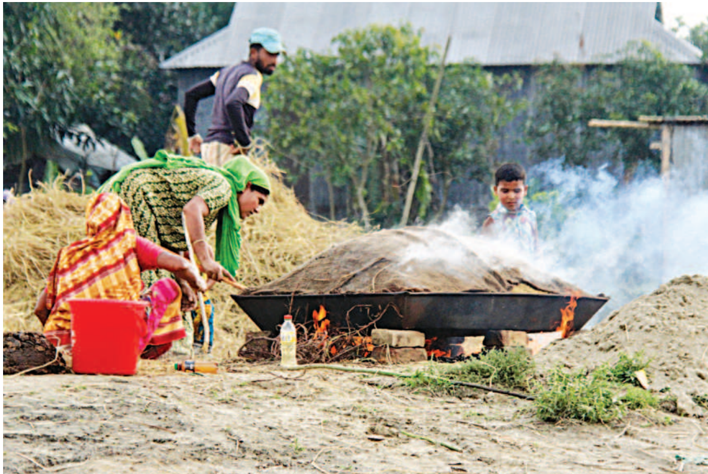
Boro harvest season has begun in the haor region of Kishoreganj. After harvesting and threshing, farmers boil the paddy in large steel pots. This process of boiling rice in its husk improves its nutritional value, makes it easier to process, and extends its shelf life. The photo was taken recently in the Badla area of Itna upazila.