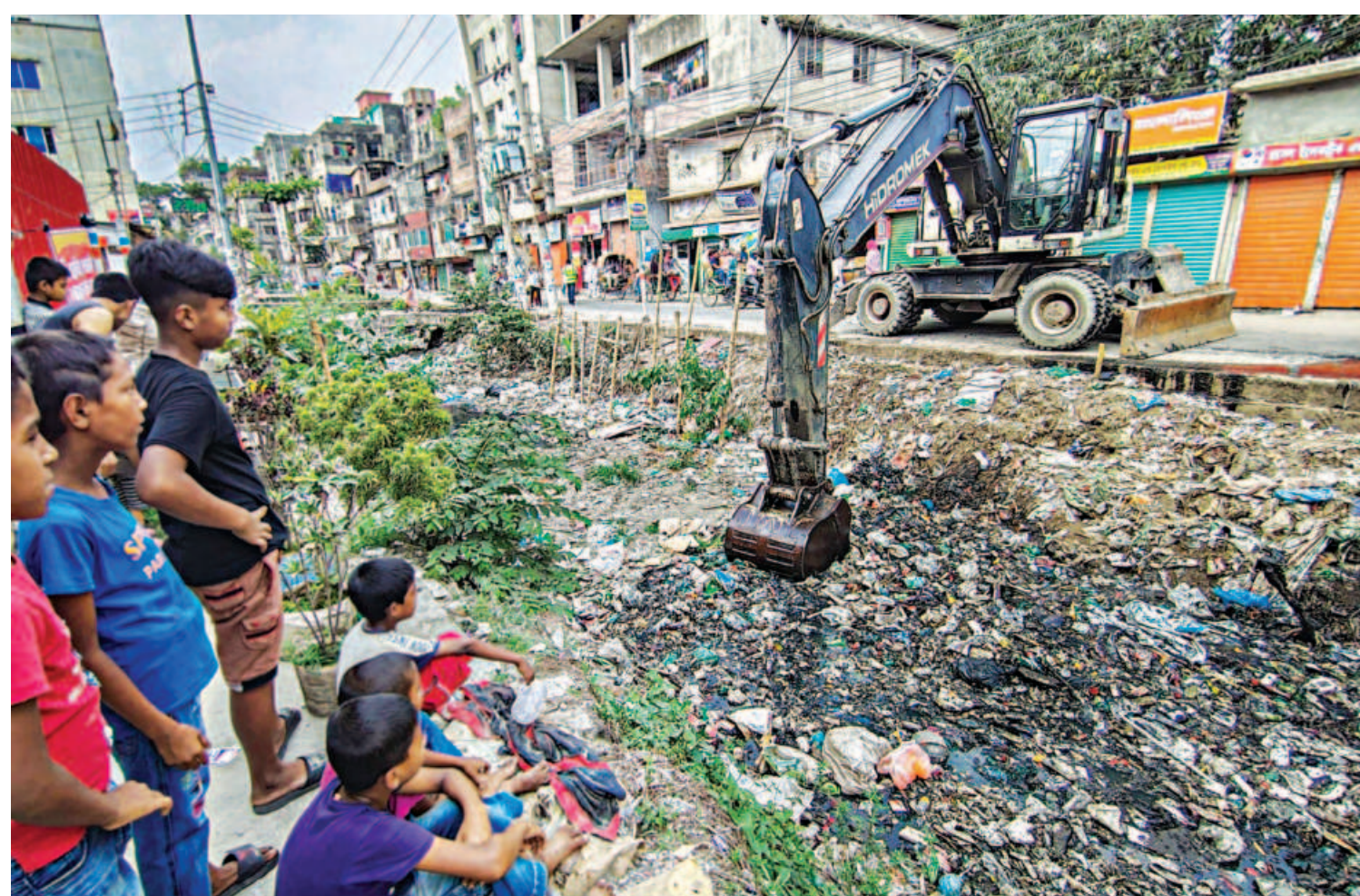
An excavator removes heaps of solid waste from the Kazla canal in the Jatrabari area of Dhaka yesterday afternoon. While the Dhaka South City Corporation has undertaken the project to improve drainage and reduce waterlogging, numerous illegal structures remain along the banks of the canal, complicating the restoration efforts.

She said the Middle East war, which erupted with the US Israeli attack on Iran on February 28, had escalated the difficulties in Gaza, "as border crossing closures and humanitarian access constraints further reduce access to life-saving support".