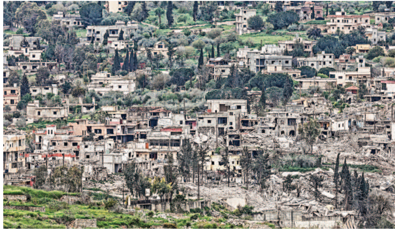
A photograph taken from the Israeli side of the border with Lebanon shows destroyed buildings in a town in southern Lebanon yesterday. Rights groups say there are significant indications that Israel is implementing a strategy in southern Lebanon that closely mirrors its military actions in Gaza.