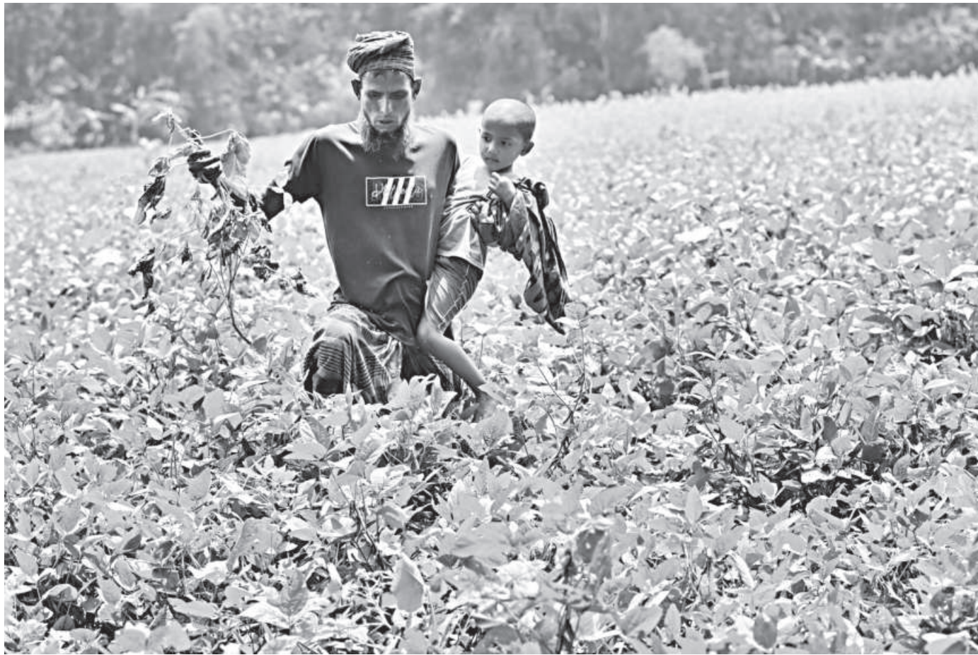
A farmer weeds a soybean field while holding his young son in his arms. The photo was taken at Ramkathi village in Barishal yesterday.

Following the incident, the victim's uncle filed a case with Meherpur Sadar Police Station.