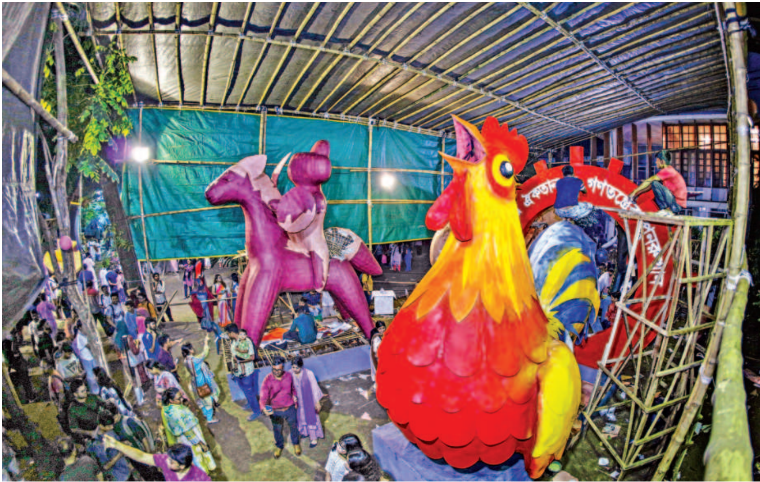
Large papier-mâché sculptures, crafted over the past few days, sit ready at the Faculty of Fine Arts of Dhaka University ahead of the Baishakhi Shobhajatra (formerly known as the Mongol Shobhajatra), to be held this morning, on the occasion of Pahela Baishakh. With the Bangla New Year set to begin with the rising sun, the faculty is abuzz with last-minute preparations as fine arts students put finishing touches on the motifs that will lead the Baishakh procession. The photo was taken yesterday.