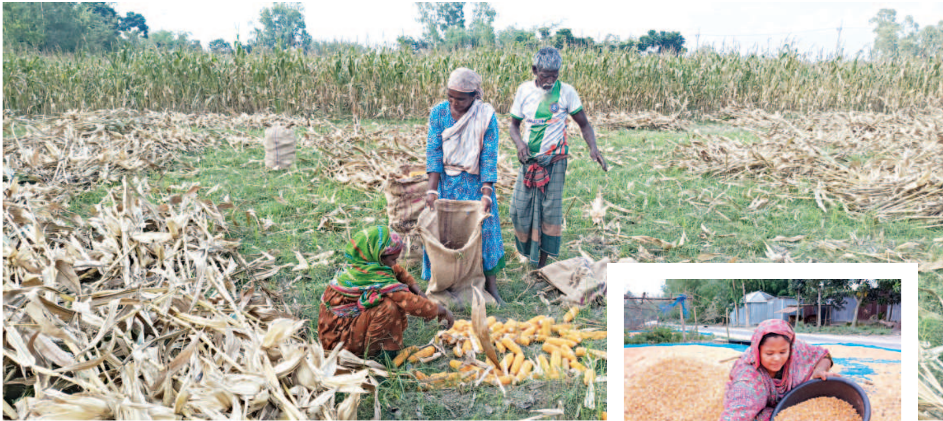
Agricultural workers collect freshly harvested corn cobs in the Teesta river char area. Inset, Another worker dries and gathers maize kernels. The photos were taken recently in Goddimari, Lalmonirhat.