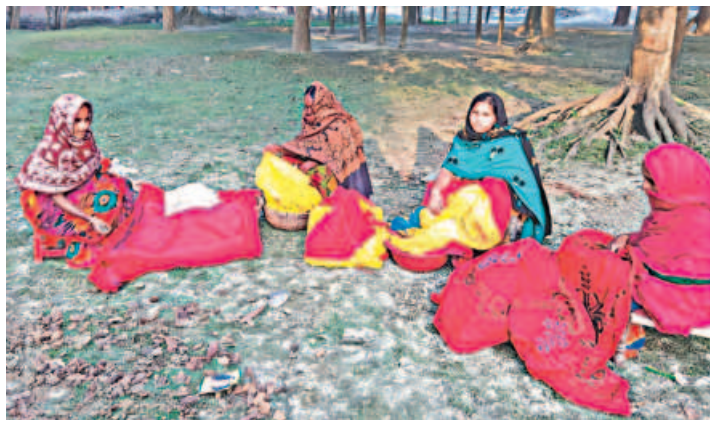
Women sewing nakshi kantha in a mango orchard near their homes in Chapainawabganj.