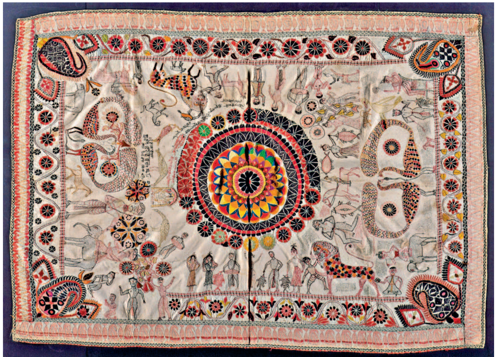
A traditional nakshi kantha.

The kantha tradition, perhaps linked back to the embroidered quilts commissioned by the Portuguese from Satgaon, helped create some very fine kanthas in the regions of Jessore, Faridpur, and Khulna in the 19 th century. Rajshahi and Kushtia also made kanthas, thicker and with fewer motifs. Notably, a kantha