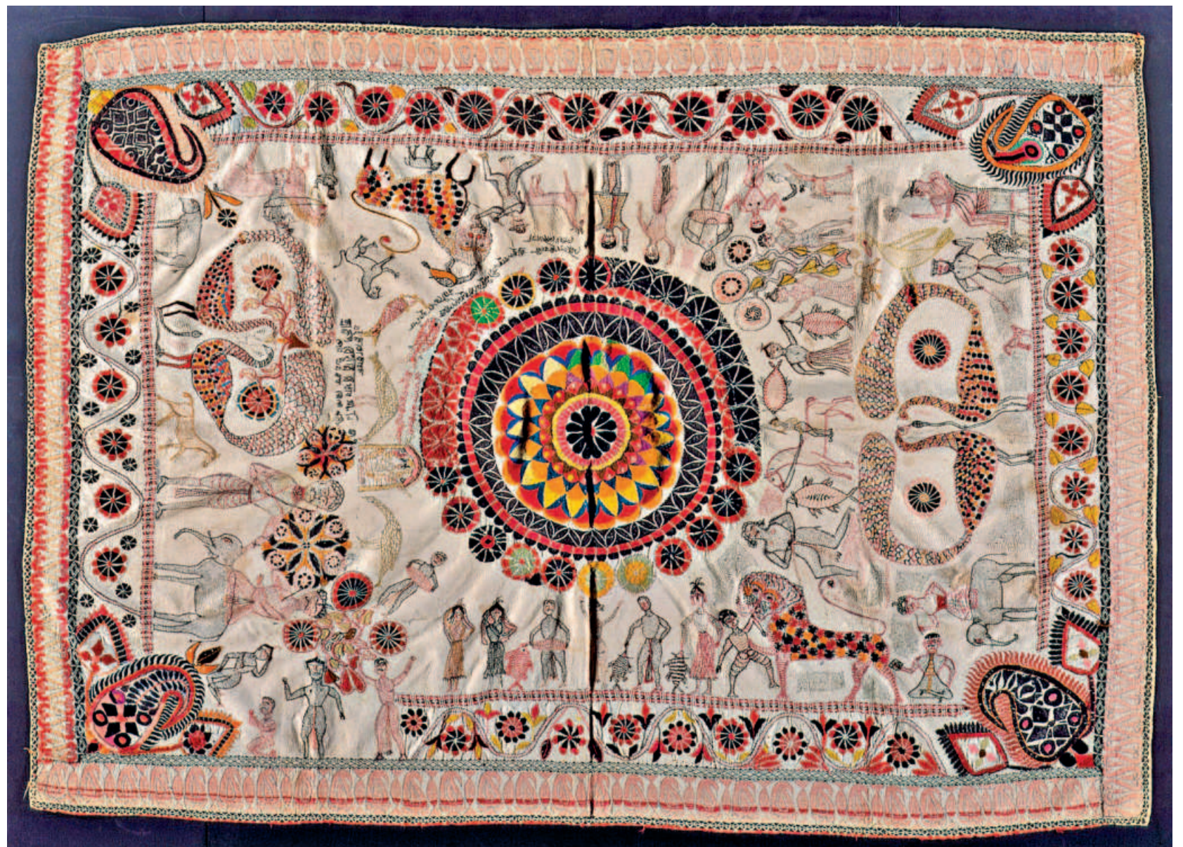
A traditional nakshi kantha.

The kantha tradition, perhaps linked back to the embroidered quilts commissioned by the Portuguese from Satgaon, helped create some very fine kanthas in the regions of Jessore, Faridpur, and Khulna in the 19 th century. Rajshahi and Kushtia also made kanthas, thicker and with fewer motifs. Notably, a kantha