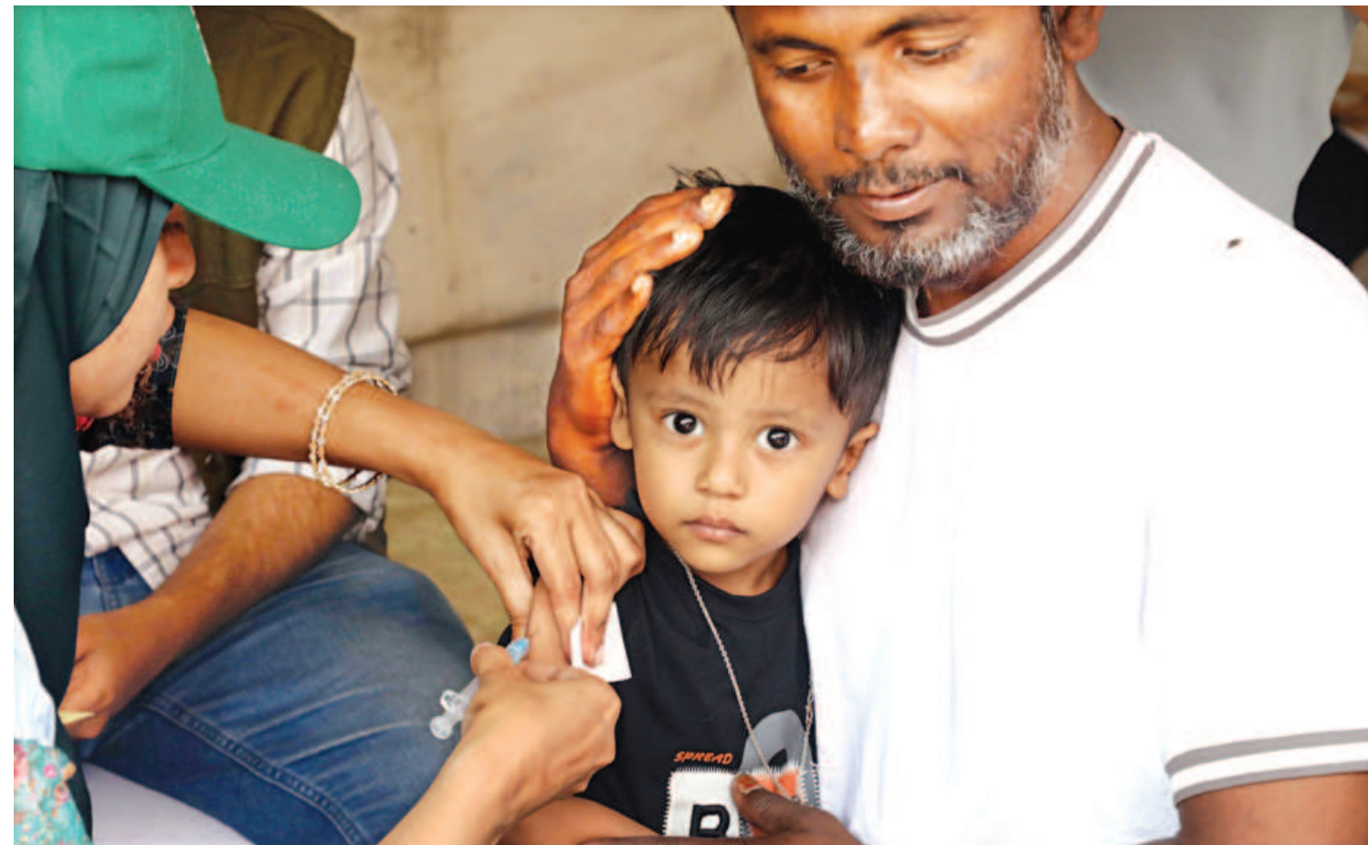
A child being jabbed in the capital's Korail slum as a special measles-rubella vaccination drive in four city corporations -- Dhaka north, Dhaka south, Mymensingh, and Barishal -- began yesterday. The health directorate recorded six more suspected measles deaths in the last 24 hours till 8:00am yesterday, taking the number to 151.