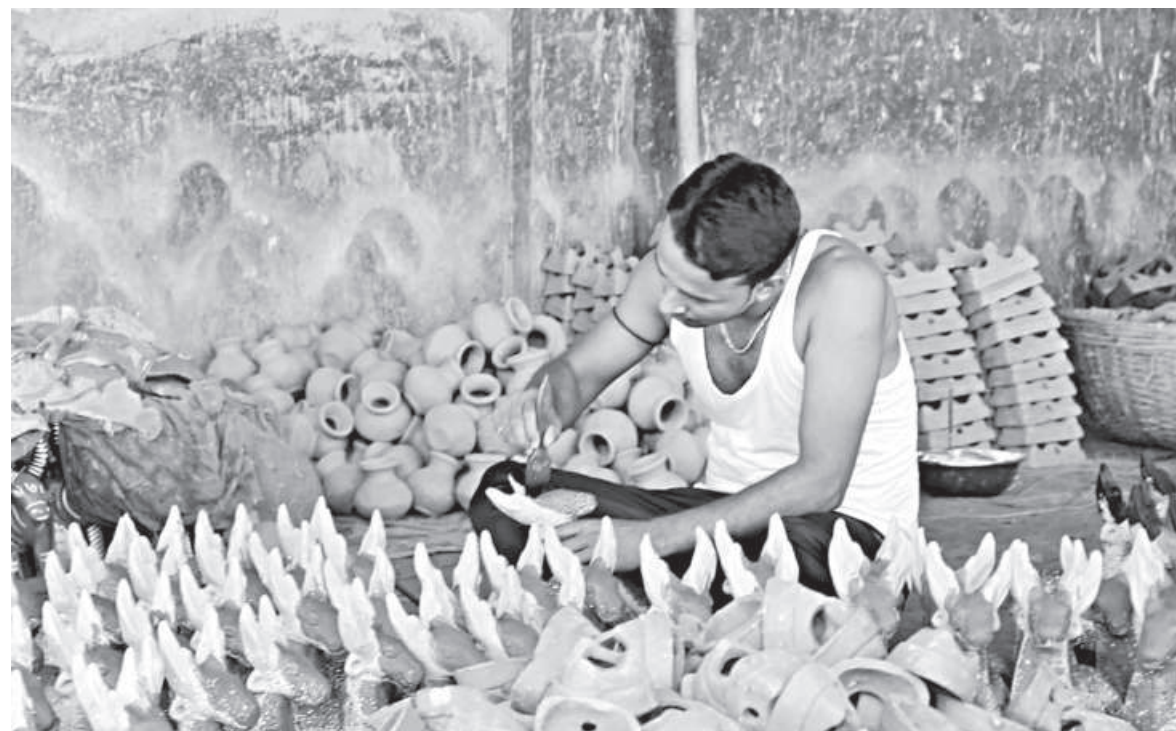
A potter paints the finishing touches on fruit, bird, and animal-shaped crafts to be sold at traditional Pahela Baishakh fairs across all nine upazilas in Brahmanbaria. The photo was taken at Paulpara in Bholachong village of Nabinagar upazila yesterday.