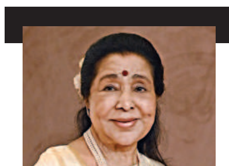
ASHA BHOSLE (1933-2026)