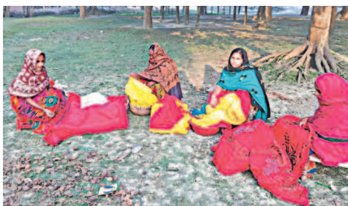
Women sewing nakshi kantha in a mango orchard near their homes in Chapainawabganj.