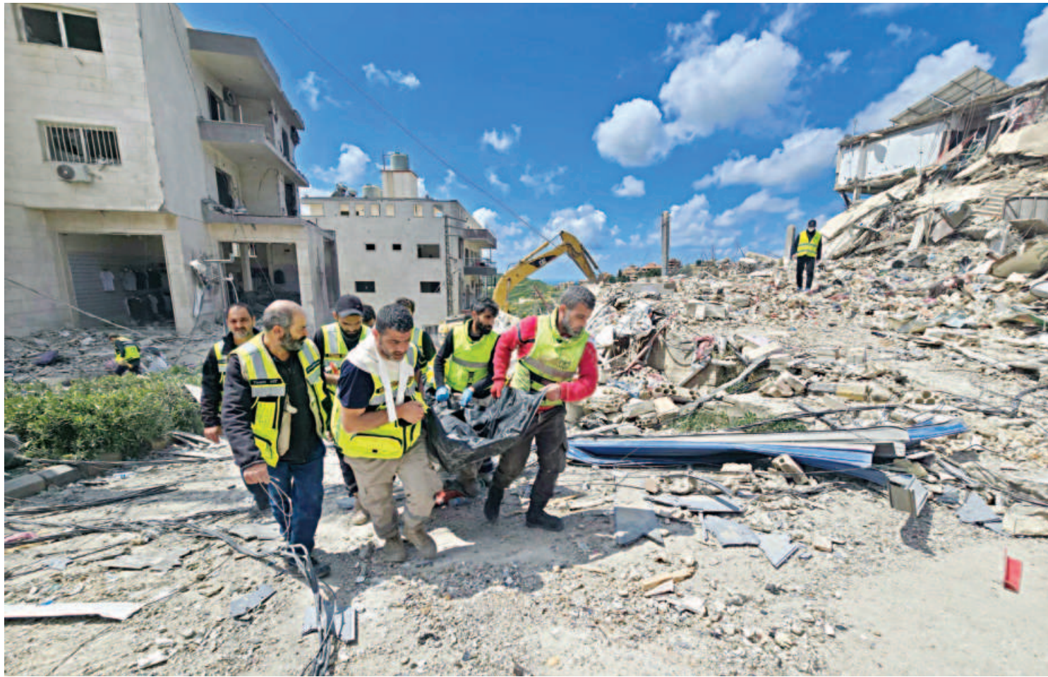
First responders carry a body from the rubble of destroyed buildings at the site of an Israeli strike that targeted the southern Lebanese village of Qana yesterday.