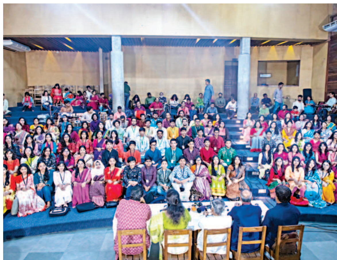
Chhayanaut authorities officially announce arrangements for the year's traditional musical welcome programme, more popularly known as 'Barshabaran', at Ramna Batamul on the occasion of Pahela Baishakh. The photo was taken at Chhayanaut's cultural centre in the capital's Dhanmondi area yesterday.