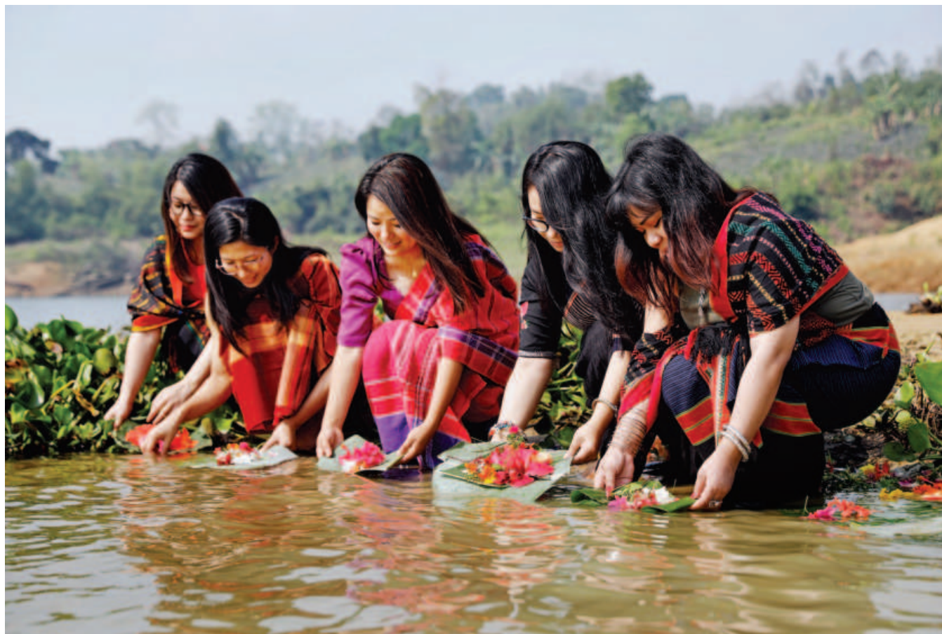
Chakma community members float flowers placed on banana leaves on Kaptai Lake in Rangamati in observance of their annual Phool Biju festivities. Hill communities in the region mark the start of the Biju festival, two days before their New Year, by floating flowers on water bodies across the Chittagong Hill Tracts in honour of Goddess Ganga. The photo was taken yesterday morning.