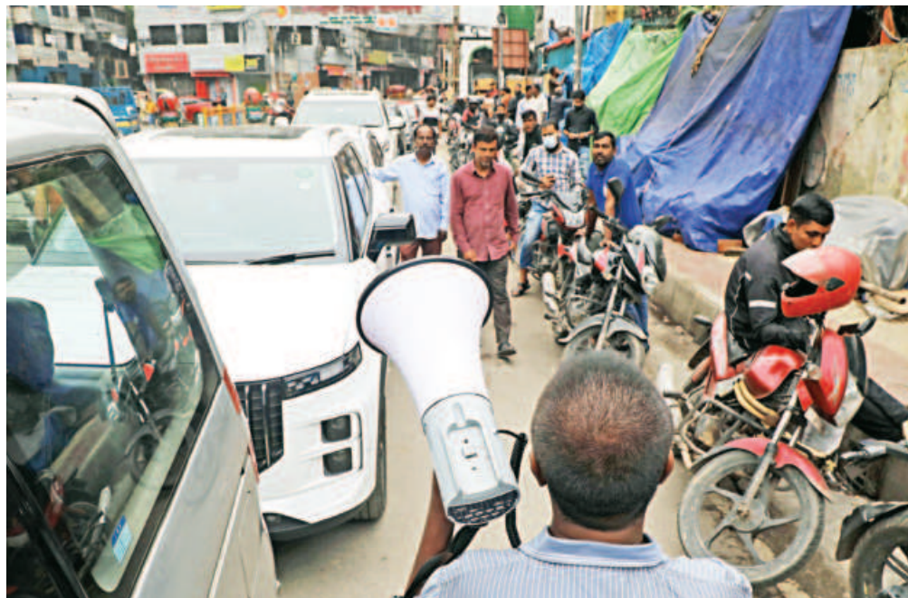
A fuel station worker announces through a megaphone that the pump has run out of fuel for the day, leaving a long queue of motorists stranded on the street in Segunbagicha, Dhaka yesterday. Some drivers had waited more than an hour in line before the announcement was made.