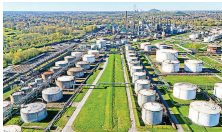
The photo shows the fuel depot of Aral at the Ruhr Oel petroleum refineries of BP Gelsenkirchen GmbH in western Germany on April 7.

"This will be a double sided CEASEFIRE!" Trump wrote on social media, after posting earlier on April 7 that "a whole civilization will die tonight" if his demands were not met.