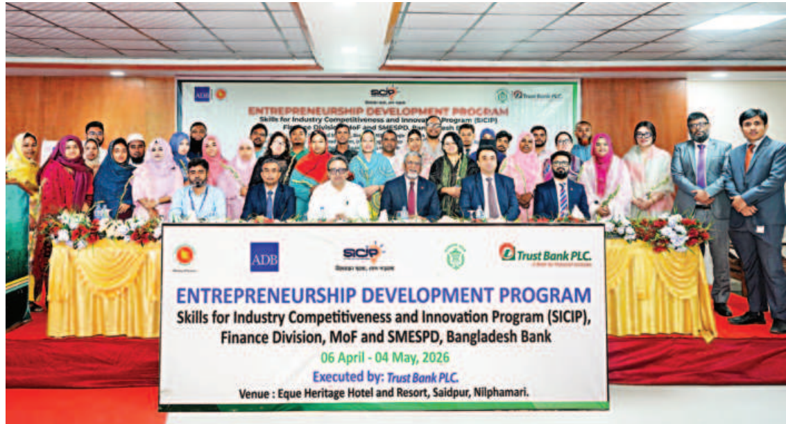
Nawshad Mustafa, director of the SME and Special Programmes Department of Bangladesh Bank, inaugurates the month-long "Entrepreneurship Development Programme", launched by Trust Bank PLC, at Eque Heritage Hotel and Resort in Saidpur, Nilphamari recently.

Bank PLC continues to reaffirm its commitment to promoting grassroots entrepreneurship and advancing inclusive economic growth across Bangladesh, in line with the national vision of building a skilled and financially empowered SME sector.