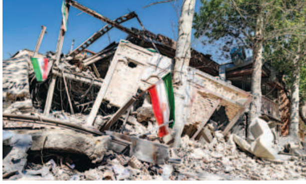
Rescuers work at the site of an Israeli strike in Beirut yesterday. Israel carried out its heaviest strikes on Lebanon since the conflict with Hezbollah began last month, killing dozens and wounding hundreds, according to Lebanon's health ministry.

Experts say the two-week postponement raises critical questions, including whether Israel would abide by the ceasefire Trump has agreed to. There are also lingering concerns about whether Israel would end its strikes against Hezbollah in Lebanon, as well as Iran's other regional allies, despite breaking similar agreements in the past.