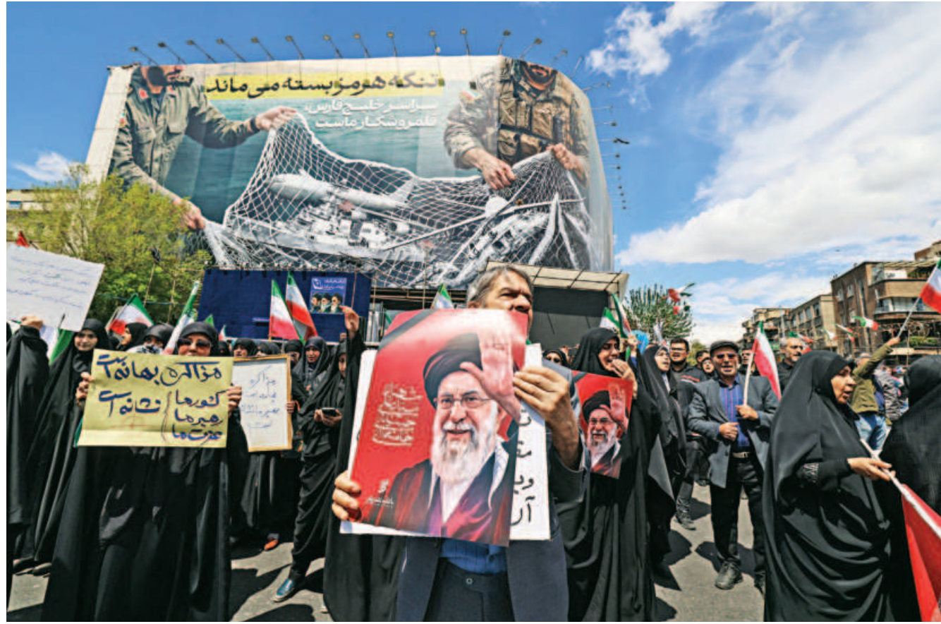
Iranians hold portraits of the country's slain supreme leader Ayatollah Ali Khamenei as they gather in Tehran's Revolution Square after the United States and Iran agreed to a two-week ceasefire yesterday.