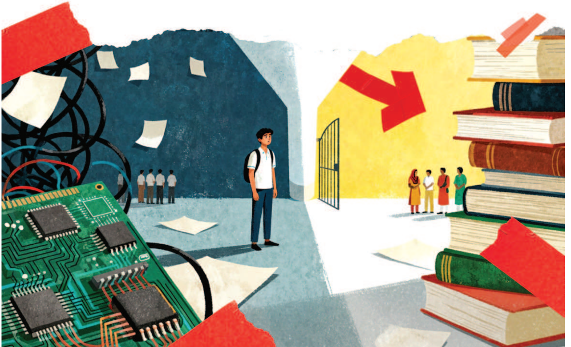
ILLUSTRATION: SALMAN SAKIB SHAHRYAR