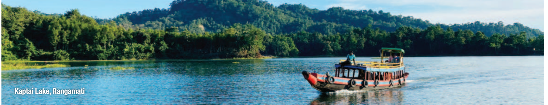
Kaptai Lake, Rangamati

Nearby, Rupali Waterfall adds a splash of charm with its silvery sheet of water tumbling over smooth rocks. With each stop, the hills reveal their hidden corners, from forest paths to panoramic viewpoints, making the