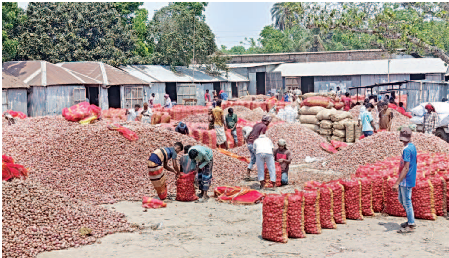
Farmers and wholesalers trading onions at the Pushpopara wholesale market in Pabna Sadar upazila. Supply exceeding demand has brought onion prices down. The photo was taken on Thursday.

A private company, which accounts for about a quarter of the domestic LPG market, raised its retail price by 23 percent to 5,700 rupees ($18.08), up from 4,630 rupees ($14.69).