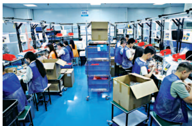
Employees work on a production line manufacturing electronics products at a factory of Agilian Technology in Dongguan, China.