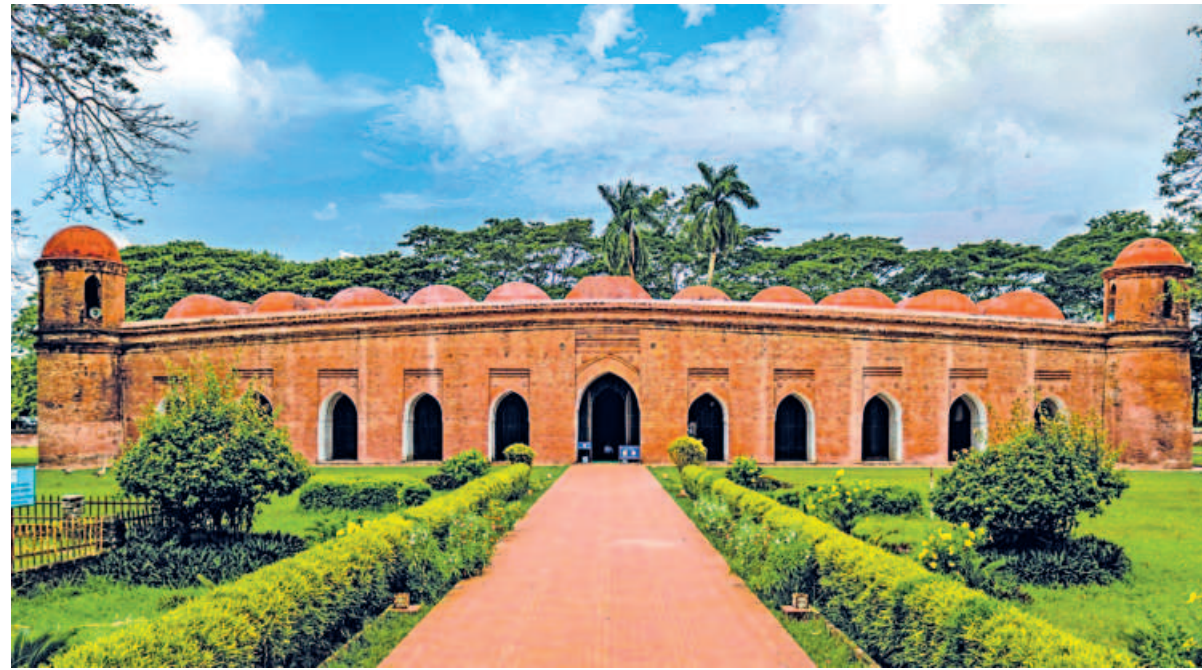
The Shatgumbad Mosque, or the Sixty Dome Mosque, a prominent monument of the Bengal Sultanate era, remains one of the most striking Islamic structures in the Indian subcontinent.

RME: Geographical and climatic factors are fundamental to Bengali history. All Bengalis understand how the entire delta is subject to immense wealth, given its plentiful water and rich topsoil, but also to the immense power, danger, and fickleness of