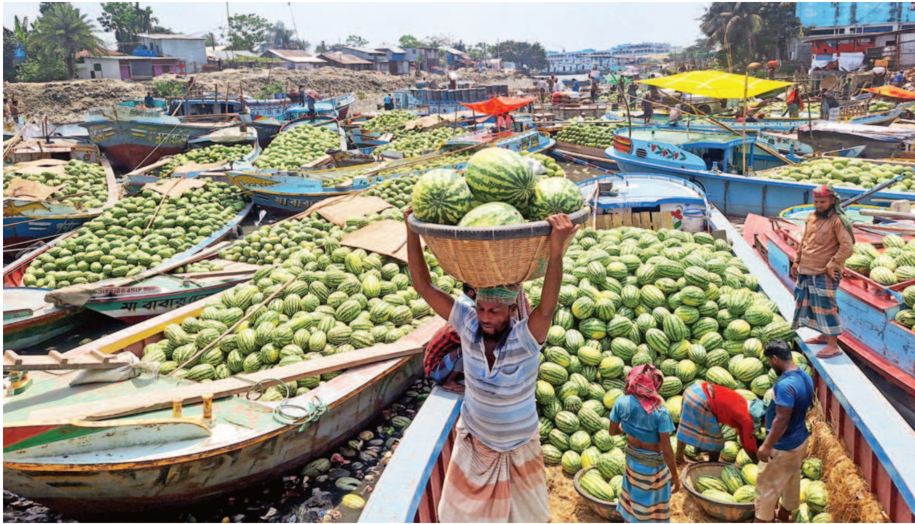
Watermelon prices have cooled at the field level after Eid, owing to weak demand. This photo was taken recently at the wholesale watermelon market of Port Road in Barishal, adjacent to the Kirtankhola river.