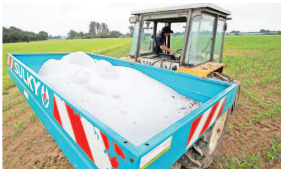
A farmer prepares to use urea fertiliser in his cornfield in La Planche near Nantes, France. In Europe, the price of nitrogen fertilisers, which are derived from gas, has risen by around 20 percent over the past month.

A commission spokeswoman said the EU executive was continuously monitoring prices and has already "taken several measures to help farmers with affordability of fertilisers".