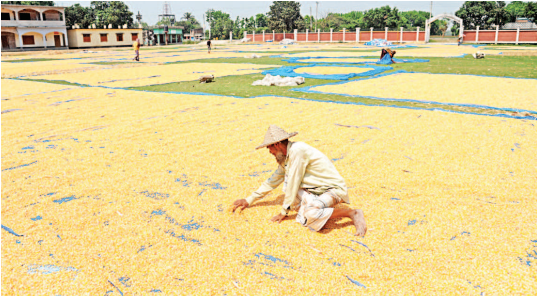
Farm workers spread and turn corn grains under the scorching sun in Premtoli area of Godagari, Rajshahi. This season's widespread corn cultivation yielded about 40 maunds per bigha. After harvesting and threshing, grains are dried in fields and on roads and sold at Tk 1,160 per maund, though farmers said slightly higher prices would have increased profits. The photo was taken recently.